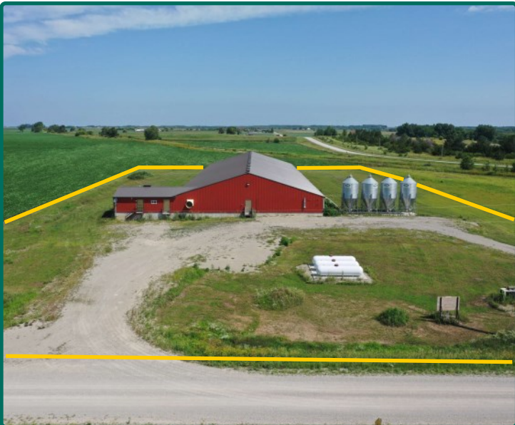
Front View of Hog Site