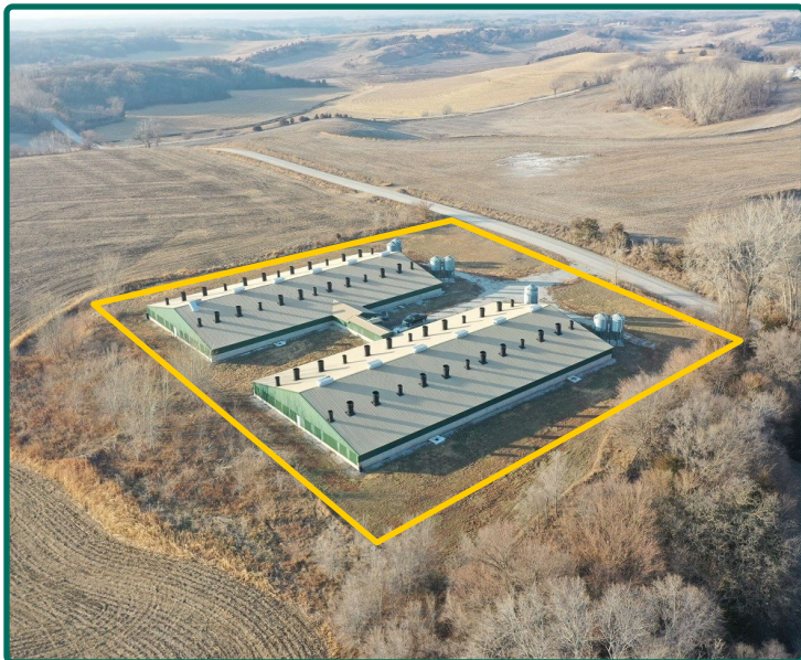
West Site - Looking Northwest