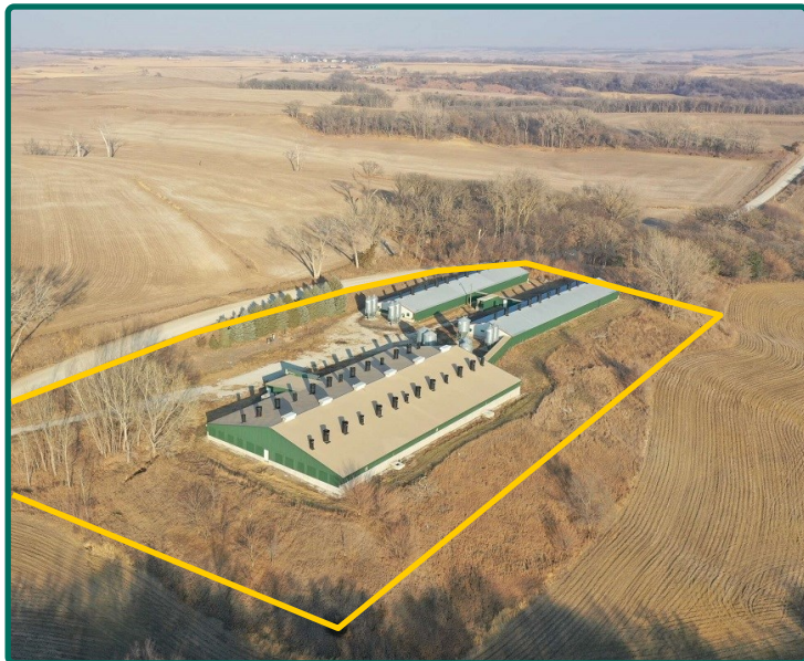
East Site - Looking Northeast