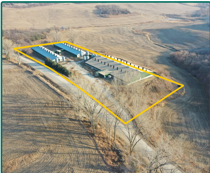
East Site - Looking Southeast