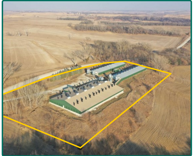
East Site - Looking Northeast