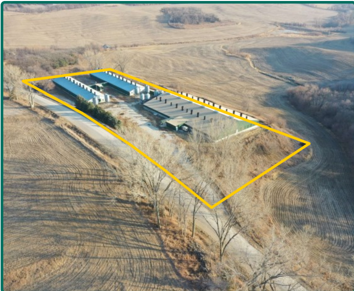
East Site - Looking Southeast