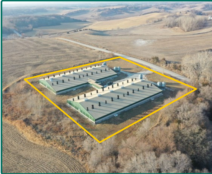
West Site - Looking Northwest