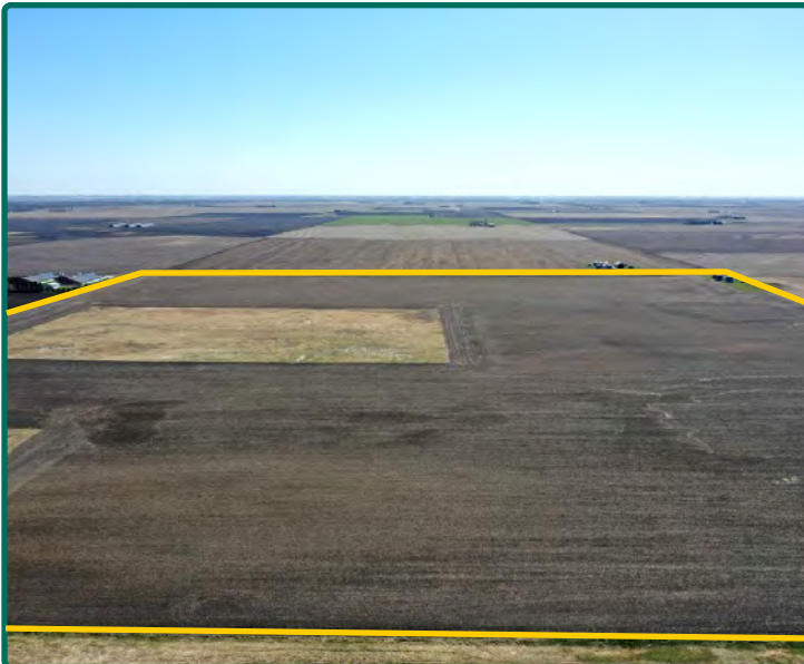
West Looking East