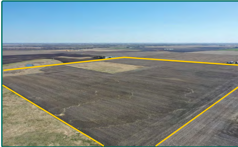
Southwest Looking Northeast