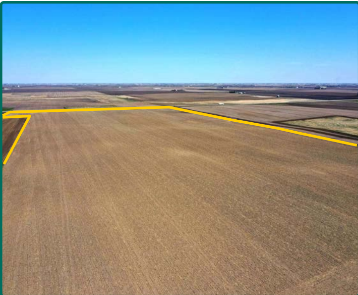
Southwest looking Northeast