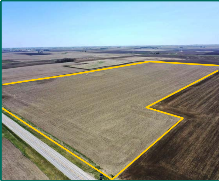
Northwest looking Southeast