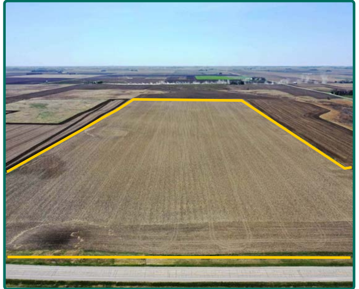
North looking South