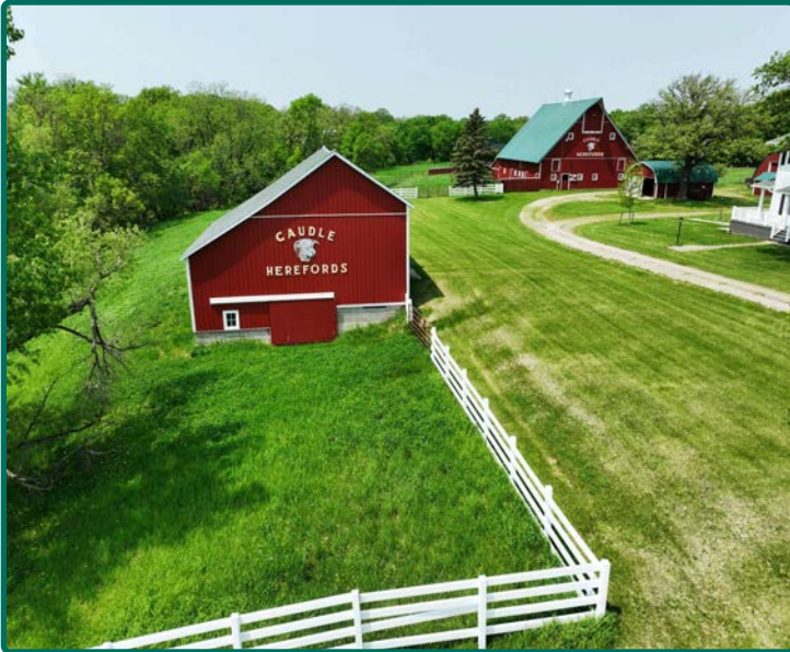
From the Hwy looking West