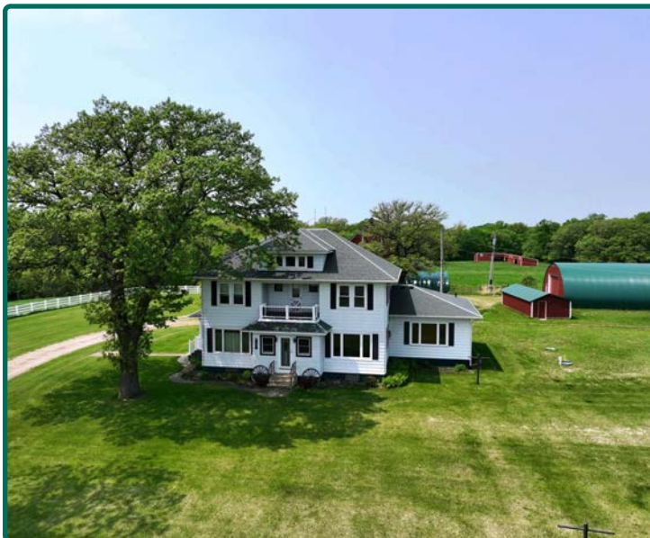
East View of the House