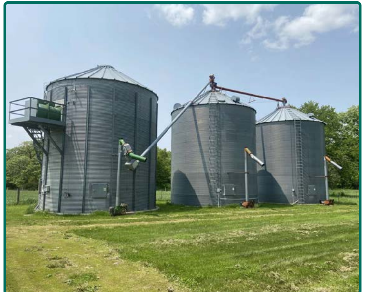
Grain Bins - 27,000 Bu. Capacity