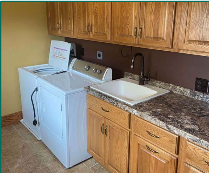
Main Floor Laundry Room