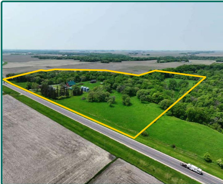
Northeast looking Southwest