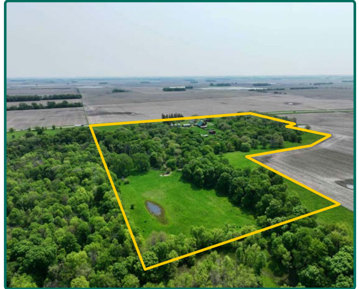
West looking East