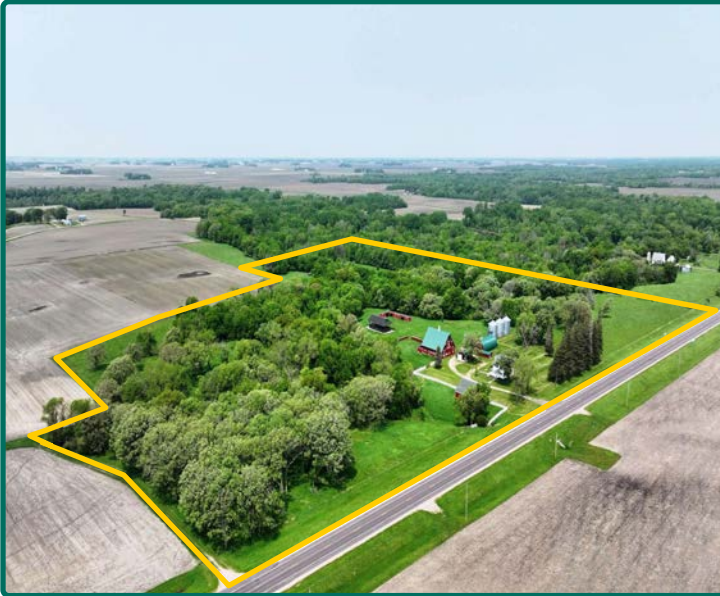
Southeast looking Northwest