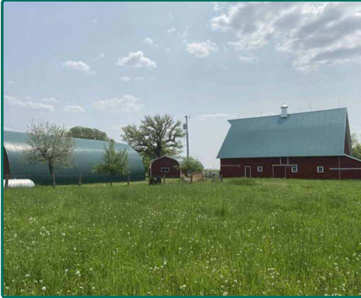
Machine Shed, Garage and Barn