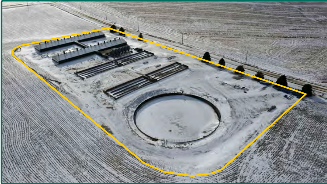
Northeast looking Southwest