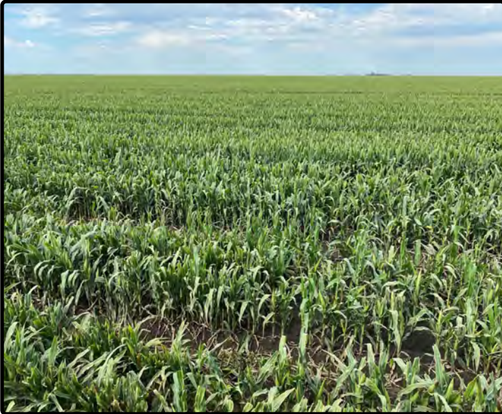
Center of Farm Looking Southwest