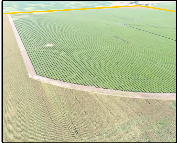
Southwest Corner Looking North