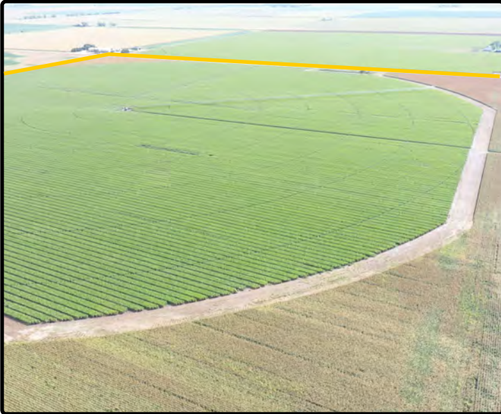
Southwest Corner Looking East