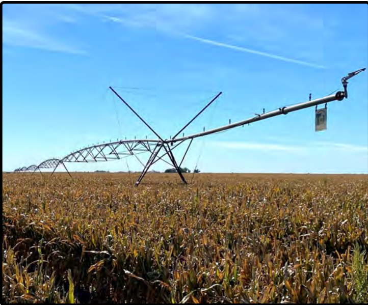
T & L 7-Tower Pivot