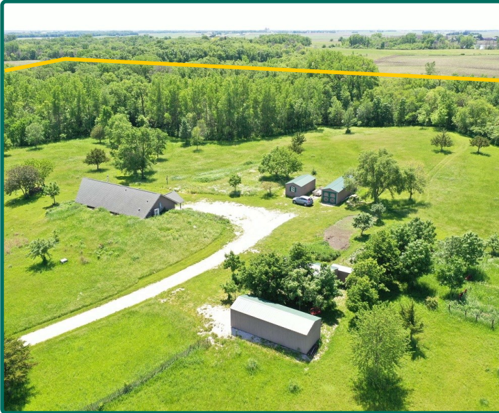
North Facing Side of Home