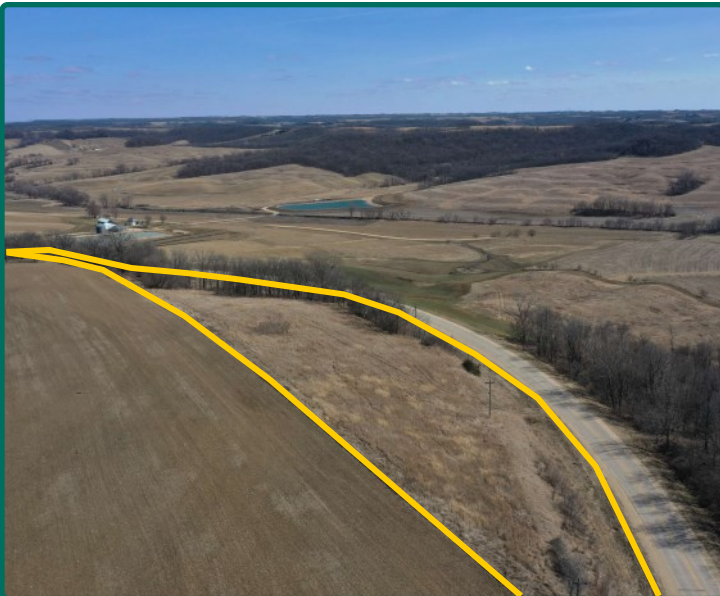
Northwest Looking Southeast