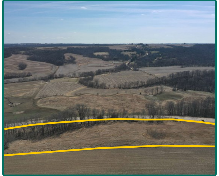
North Looking South