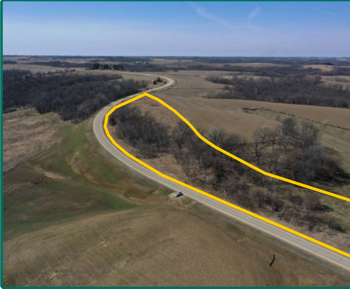
Southeast Looking Northwest