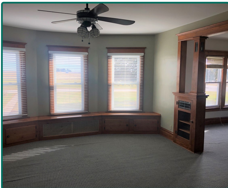
Dining Room Looking East