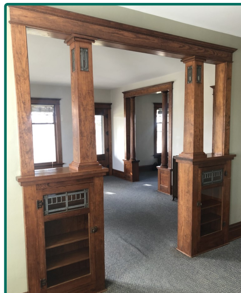
Woodwork between Dining Room, Living Room, and Den