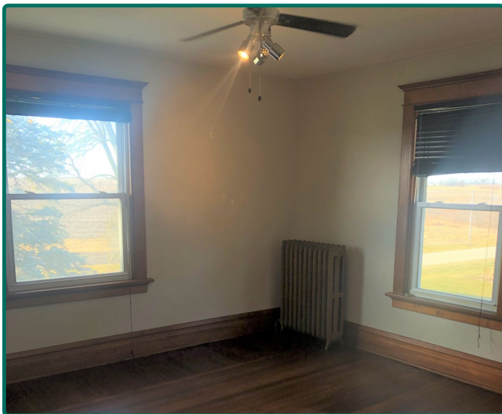
Second Level Bedroom Looking Southwest