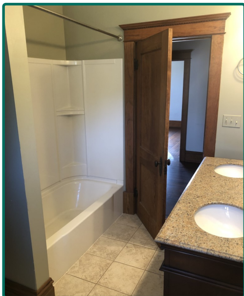
Second Level Bathroom