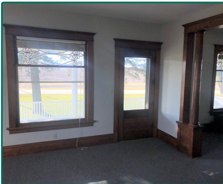
Front Windows and Door Looking out to the Front Porch