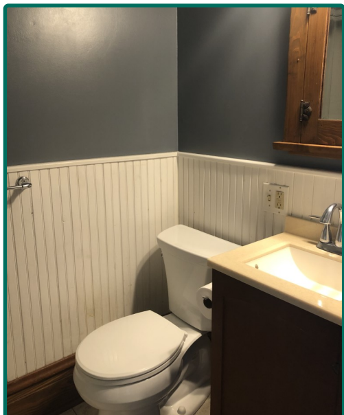
Main Level Bathroom