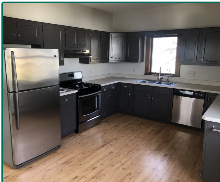
Eat-in Kitchen with Updated Appliances