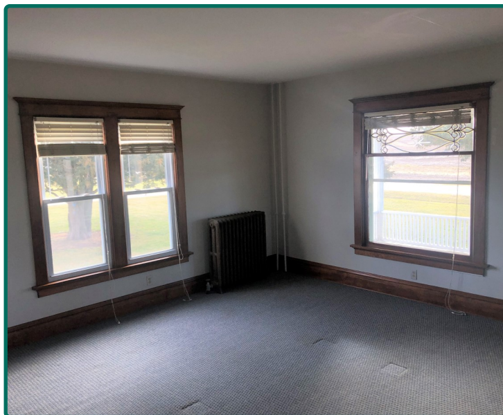
Living Room Looking Southeast