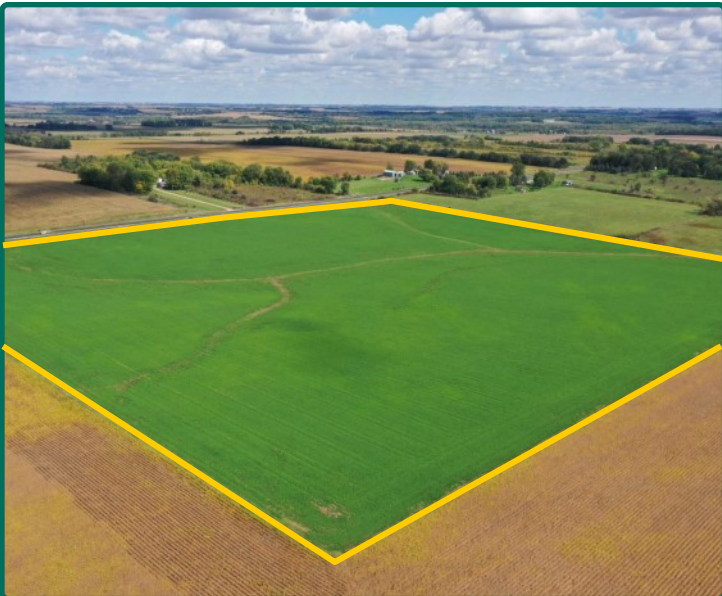
Southwest looking northeast