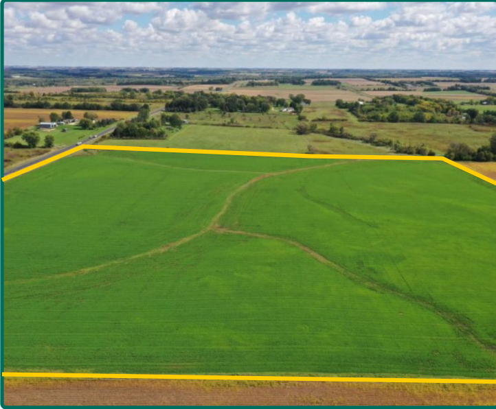
North looking south