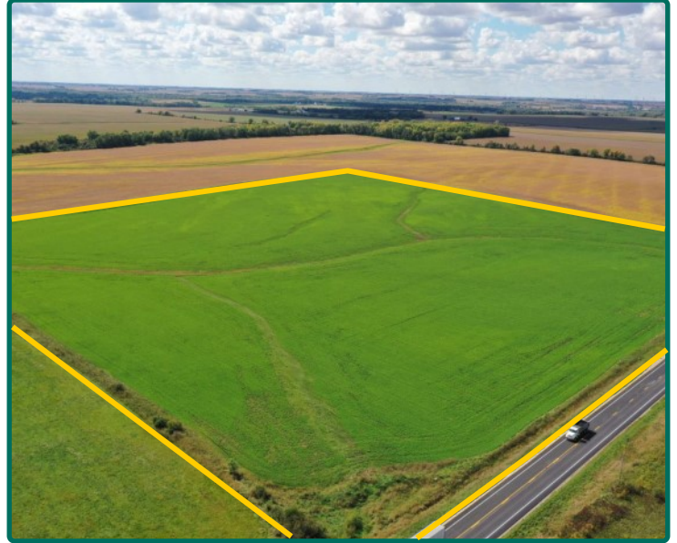
Northeast looking southwest