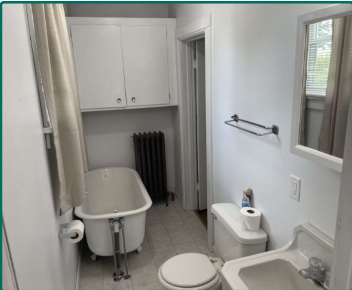
Main Floor Bathroom