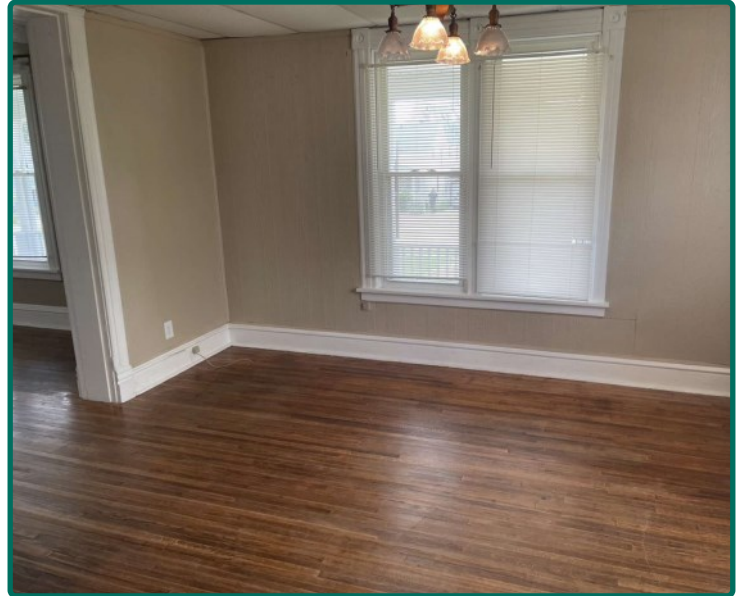
Main Floor Living and Dining Room