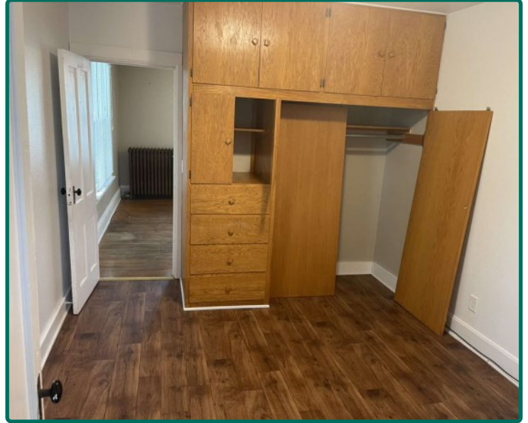
Main Floor Bedroom