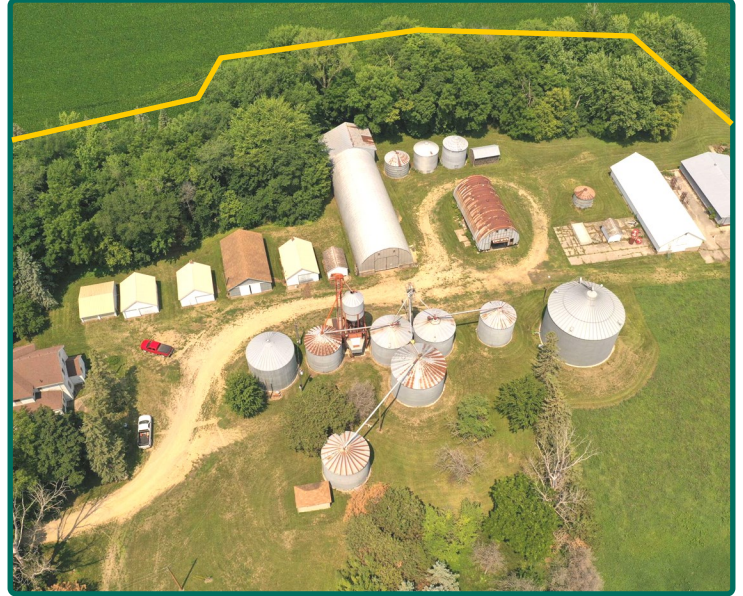
South Looking North