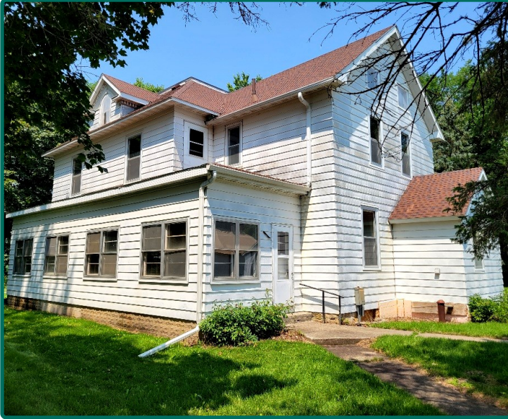
South Side of House