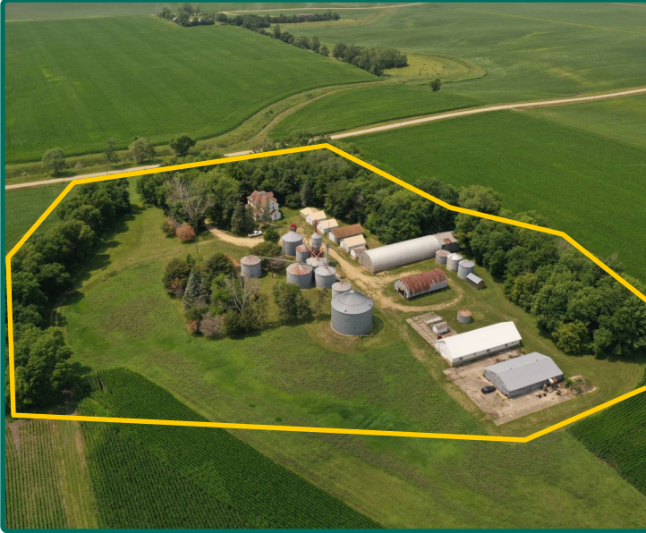
Southeast Looking Northeast