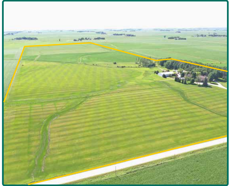
Southern Portion of Property - Looking Northwest