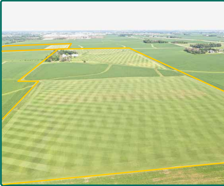
Southern Portion of Property - Looking East