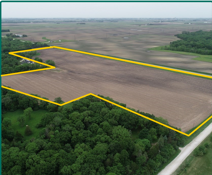
Northeast Looking Southwest