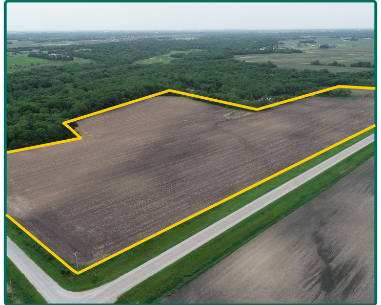
Northwest Looking Southeast