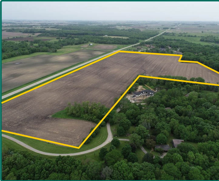
Southeast Looking Northwest