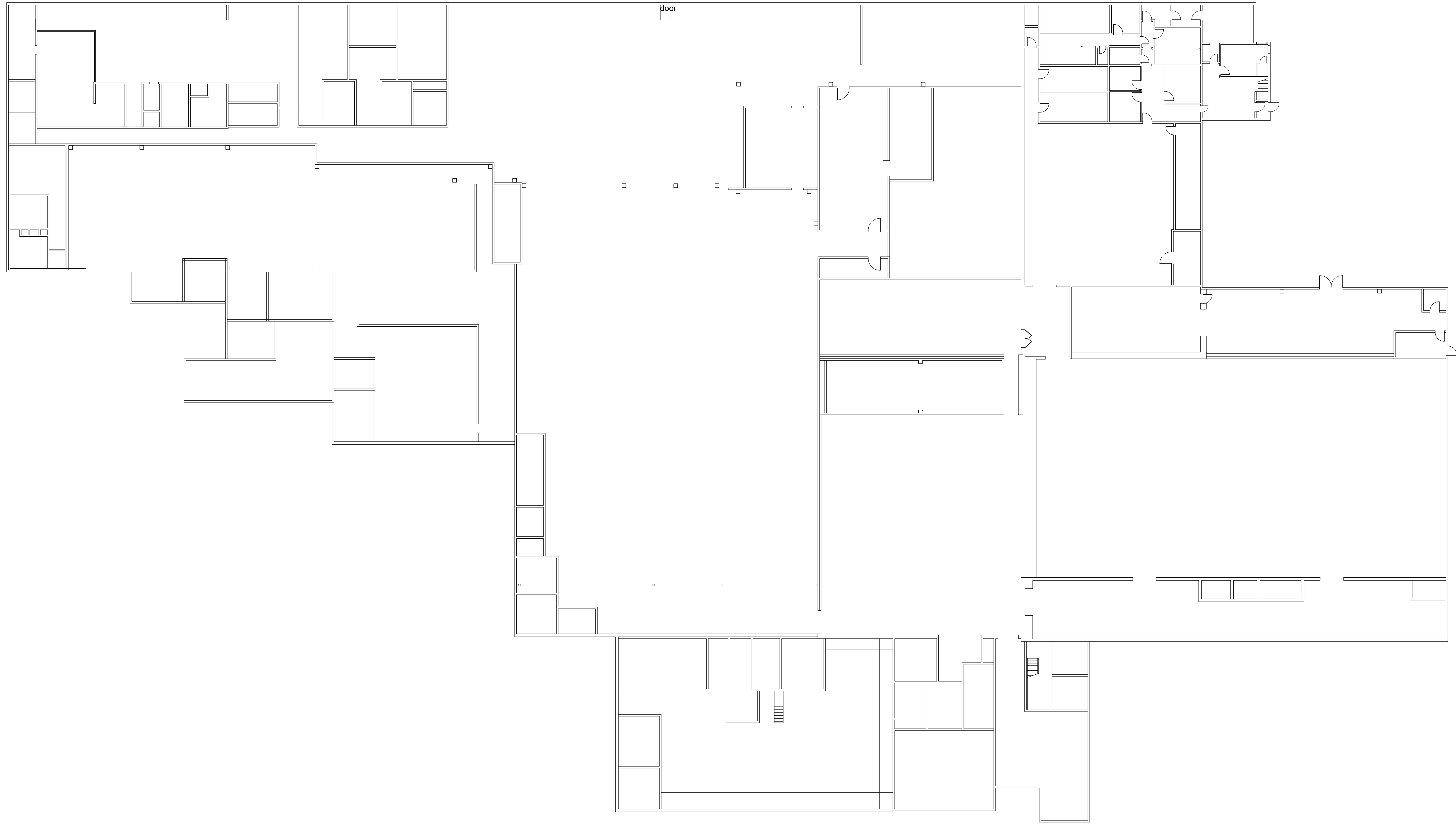
1 EXISTING FLOOR PLAN