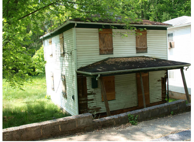
( http://images.vgsi.com/photos/StauntonVAPhotos/A00\00\61\57.JPG )