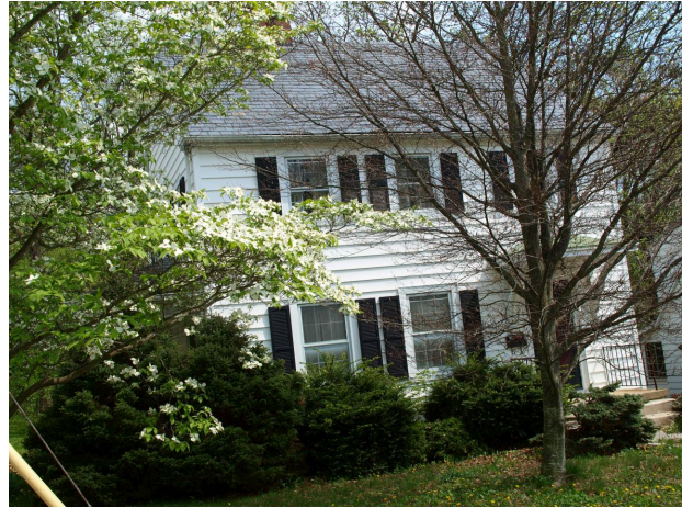
( http://images.vgsi.com/photos/StauntonVAPhotos/A00\00\53\27.JPG )