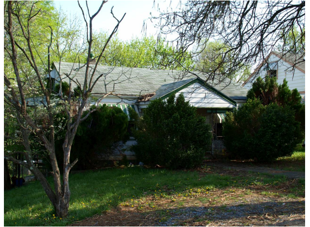
( http://images.vgsi.com/photos/StauntonVAPhotos/A00\00\25\54.JPG )