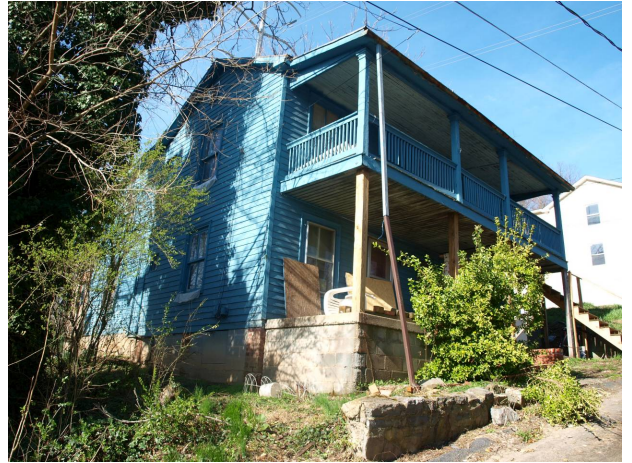
( http://images.vgsi.com/photos/StauntonVAPhotos/A00\00\32\85.JPG )