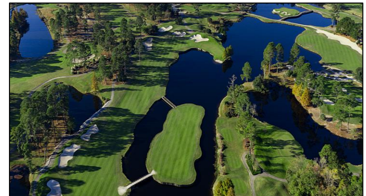
Myrtle Beach National Golf Course

Disclaimer; the information above has been obtained from sources deemed reliable. While we do not doubt the accuracy, we have not verified it and make no guarantee, warranty or representation about it. Any projections, opinions, assumptions or estimates used are for example only and do not present the current or future performance of the property. It is your responsibility to independently verify the accuracy and completeness of the information.