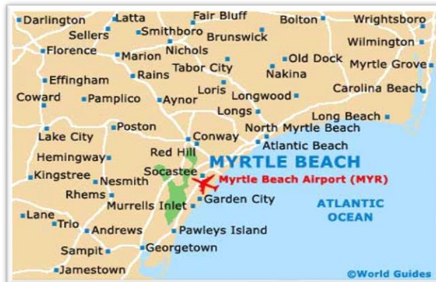
Myrtle Beach MSA

There are endless opportunities for families to play along the Grand Strand. Encounter sharks at Ripley's Aquarium. Or, head almost 200 feet in the sky on the Myrtle Beach SkyWheel. There are whimsical sights to be found at the WonderWorks Science Center. Racing fans can test their skills at the NASCAR Racing Experience, while Wild Water and Wheels' 33 exciting rides will bring out the kid in everyone. The Myrtle Beach area is bustling with culture and personality. Enjoy the wonders of Brookgreen Gardens, learn the history of Atalaya Castle, discover our past at the Horry County Museum or learn the art of weaving a rope hammock at Pawleys Island Rope Hammock Shop. The Grand Strand boasts a variety of award-winning music, dance, comedy, dinner shows and celebrity concerts. Enjoy a night at The Alabama Theatre, The Carolina Opry or any of the area's other live entertainment theatres. The Myrtle Beach area is historically known for its fresh local seafood and Lowcountry ingredients like Carolina rice, stone-ground grits and blue crab. The area boasts world-class golf courses and miniature golf.