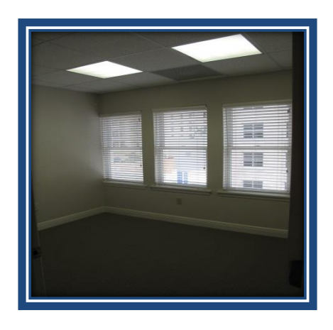
Disclaimer; the information above has been obtained from sources deemed reliable. While we do not doubt the accuracy, we have not verified it and make no guarantee, warranty or representation about it. Any projections, opinions, assumptions or estimates used are for example only and do not present the current or future performance of the property. It is your responsibility to independently verify the accuracy and completeness of the information.