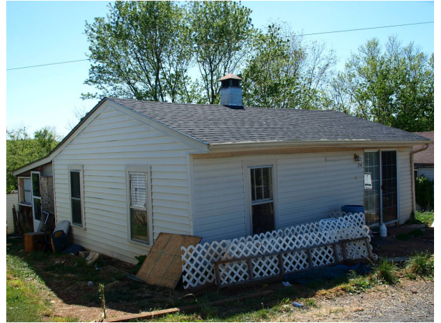
( http://images.vgsi.com/photos/StauntonVAPhotos//\00\00\36/ )