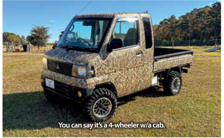
You can say it's a 4-wheeler w/a cab.