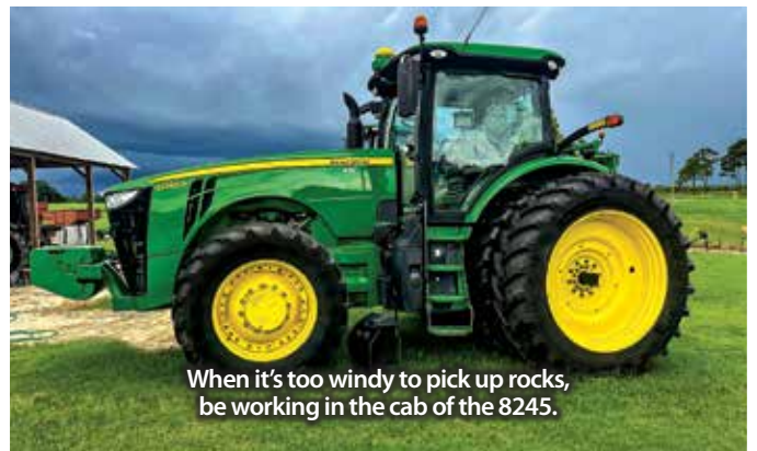
When it's too windy to pick up rocks, be working in the cab of the 8245.