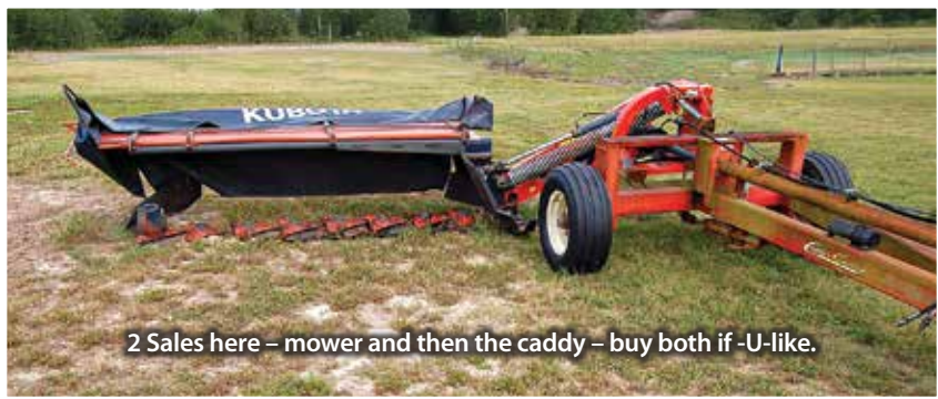
2 Sales here – mower and then the caddy – buy both if -U-like.