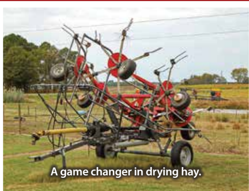
A game changer in drying hay.