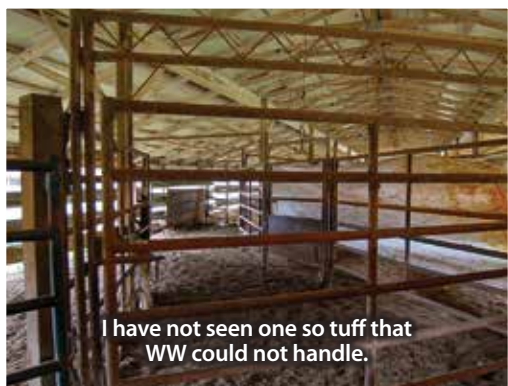
I have not seen one so tuff that WW could not handle.