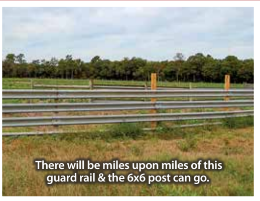
There will be miles upon miles of this guard rail & the 6x6 post can go.

Terms & Conditions: All purchases must be paid for sale day. All property sells as is where is with all faults, with absolutely no warranties implied or expressed in any way. All Serial Numbers, mileage & hrs. unverified. All info printed in brochure is believed to be correct but not guaranteed. Announcements made day of sale take precedence over printed material.