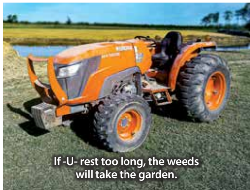
If -U- rest too long, the weeds will take the garden.