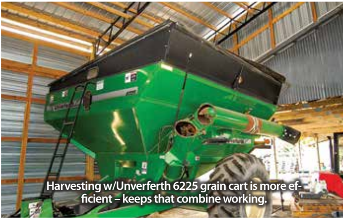
Harvesting w/Unverferth 6225 grain cart is more ef- ficient – keeps that combine working.