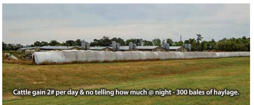
Cattle gain 2# per day & no telling how much @ night - 300 bales of haylage.

(2) Priefert 10' panels w/chain latches, powdered coated.