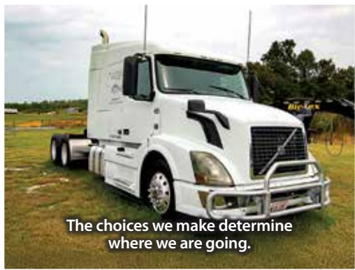
The choices we make determine where we are going.