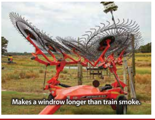
Makes a windrow longer than train smoke.