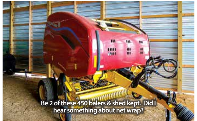
Be 2 of these 450 balers & shed kept. Did I hear something about net wrap?