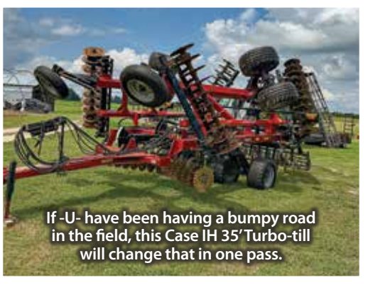
If -U- have been having a bumpy road in the field, this Case IH 35' Turbo-till will change that in one pass.