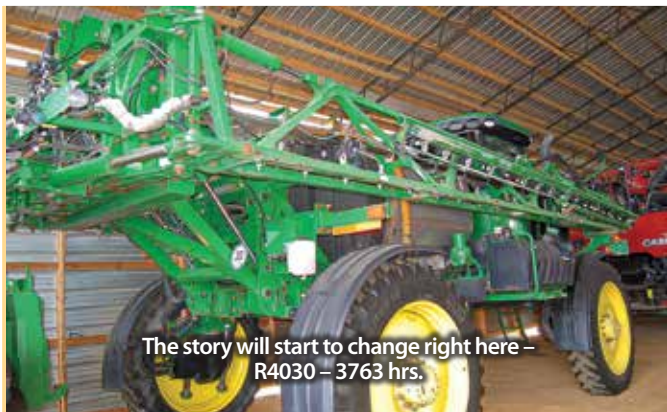
The story will start to change right here – R4030 – 3763 hrs.

SALE SITE ADDRESS: 441 Lindsay Farm Lane – Clinton, NC