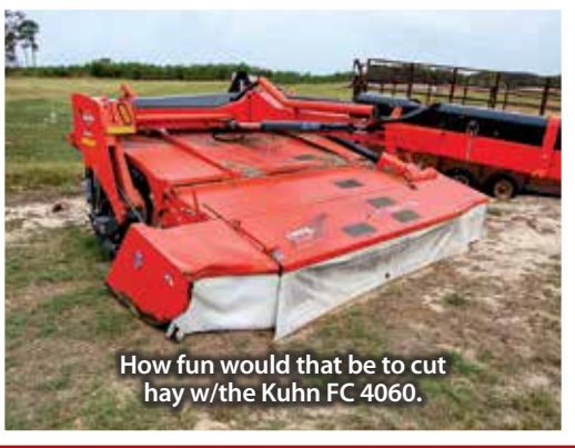
How fun would that be to cut hay w/the Kuhn FC 4060.