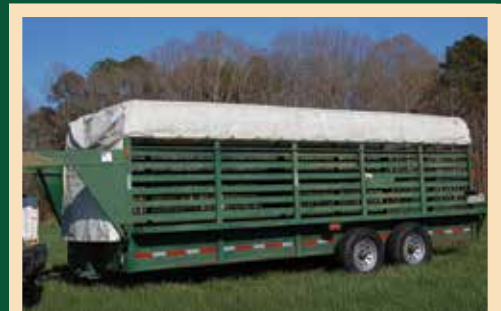
Whenever -U- sit in line to unload cattle will be cool in this 20' trailer.