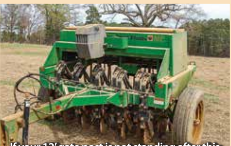
If your 12' gate post is not standing after this Great Plains no-till passes thru -U- may want to consider putting some mirrors on your tractor.