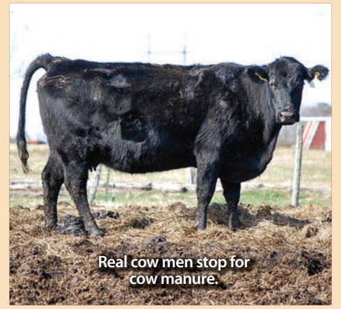
Real cow men stop for cow manure.

Mark your calendar so you won't miss it. for this year. Saturday 19th April. The Annual Warren County Cow Pasture Equipment Auction date has been changed to