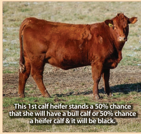
This 1st calf heifer stands a 50% chance that she will have a bull calf or 50% chance a heifer calf & it will be black.