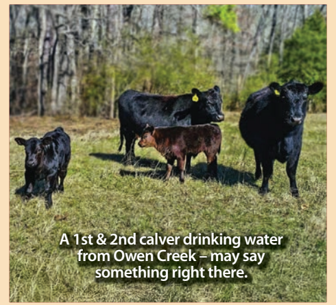
A 1st & 2nd calver drinking water from Owen Creek - may say something right there.