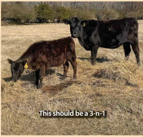
This should be a 3-n-1