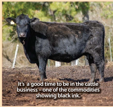
It's a good time to be in the cattle business - one of the commodities showing black ink.