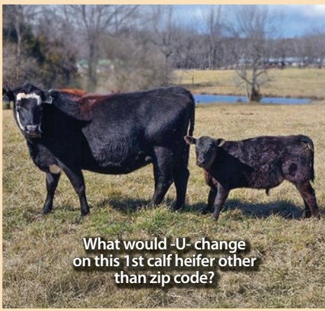
What would -U- change on this 1st calf heifer other than zip code?