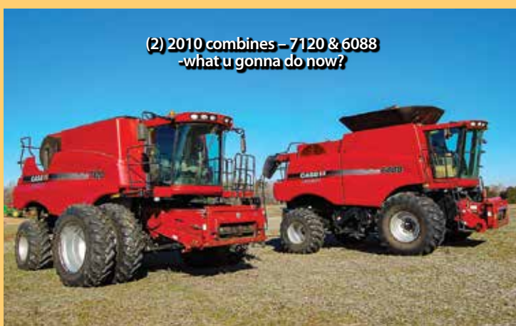
(2) 2010 combines – 7120 & 6088 -what u gonna do now?