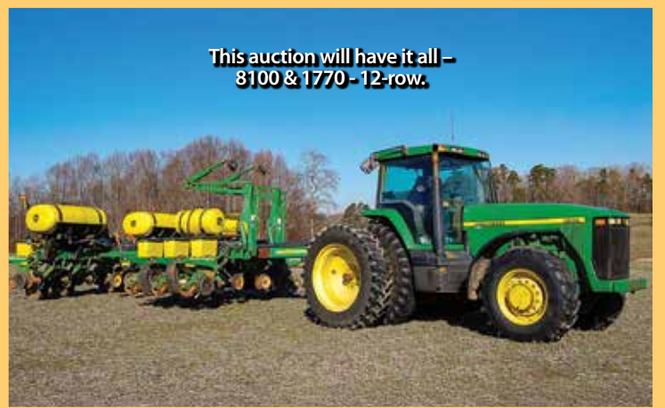
This auction will have it all – 8100 & 1770 - 12-row.