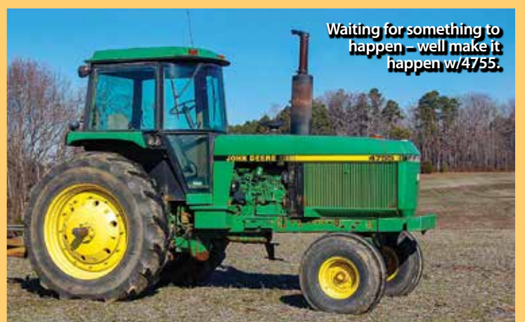
Waiting for something to happen – well make it happen w/4755.