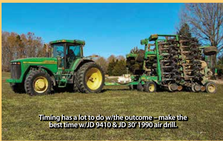
Timing has a lot to do w/the outcome – make the best time w/JD 9410 & JD 30' 1990 air drill.

SALE SITE ADDRESS: 240 Millbridge Rd. – China Grove, NC