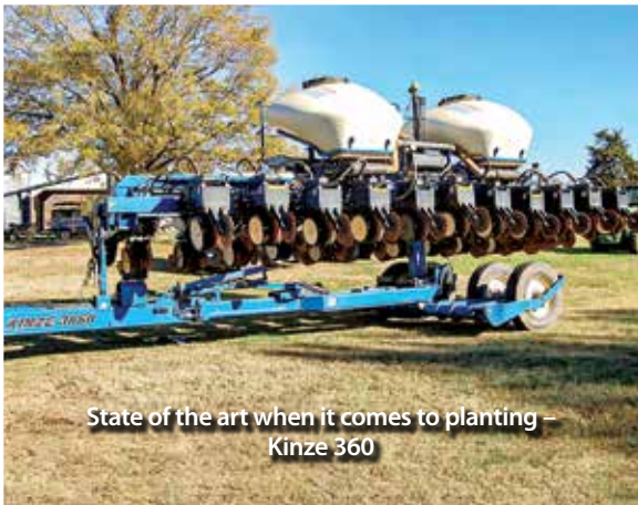
State of the art when it comes to planting – Kinze 360