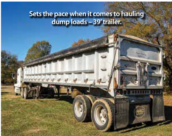
Sets the pace when it comes to hauling dump loads – 39' trailer.