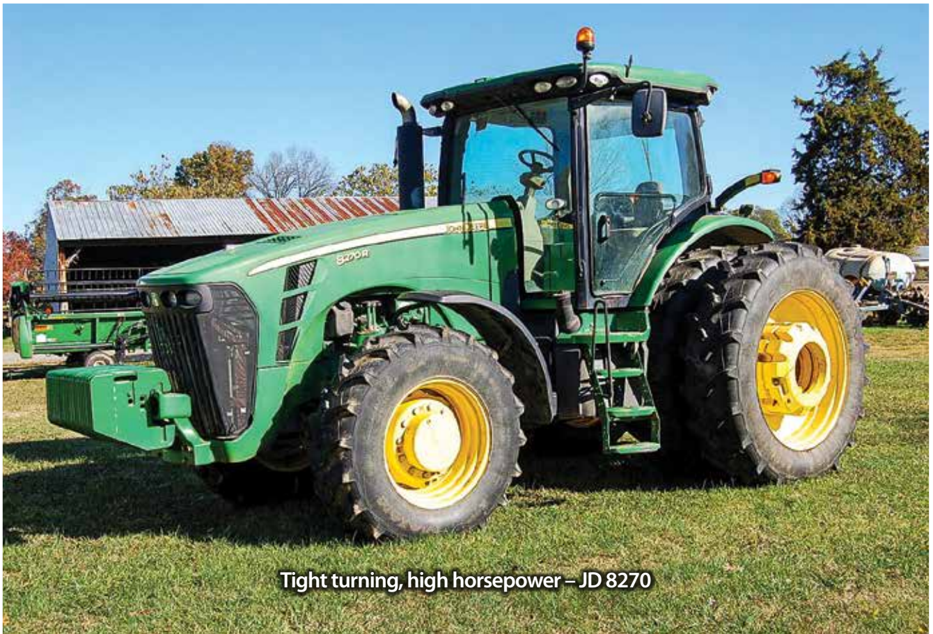
Tight turning, high horsepower – JD 8270

Sale Site Address: 2788 Pike Farm Rd. – Staley, NC – NOTE: Equipment will be @ farm location in Liberty, NC & will be moved to sale location - Staley, NC week of sale.