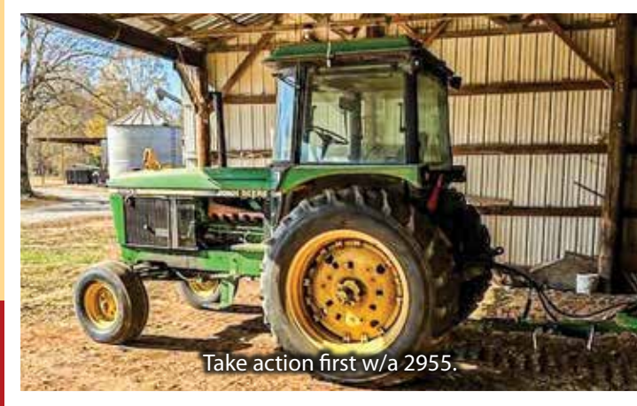
Take action first w/a 2955.

JUST HOLD TIGHT - EQUIPMENT WILL BE - MOVED TO SALE SITE - WEEK OF SALE