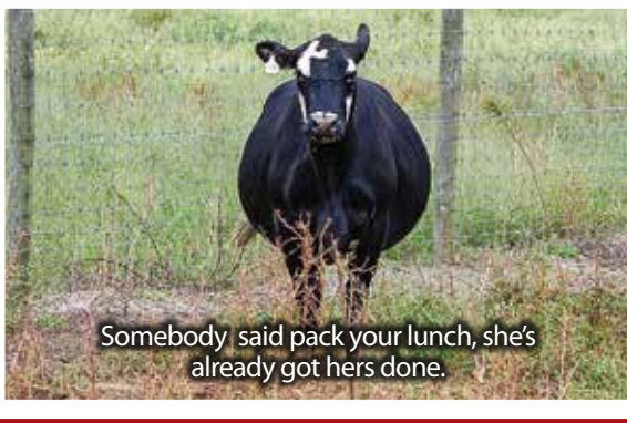
Somebody said pack your lunch, she's already got hers done.