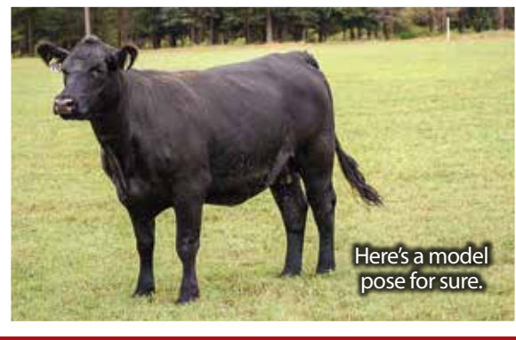
Here's a model pose for sure.