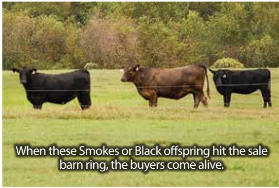
When these Smokes or Black offspring hit the sale barn ring, the buyers come alive.

SALE SITE ADDRESS: 93 Agriculture Way – Clinton, NC 28328