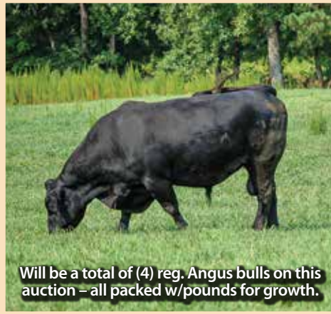
Will be a total of (4) reg. Angus bulls on this auction – all packed w/pounds for growth.