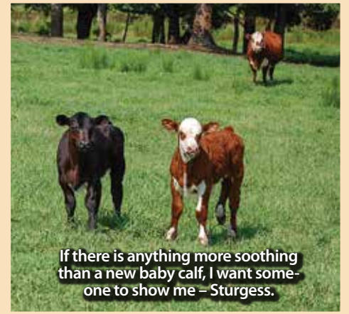
If there is anything more soothing than a new baby calf, I want someone to show me – Sturgess.