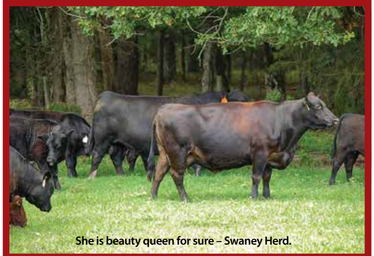
She is beauty queen for sure – Swaney Herd.

Sale order available sale day or check the web late Friday afternoon for posting. Print before you come & have a head start w/the pens marked that will fit your farm.