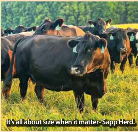
It's all about size when it matter- Sapp Herd.