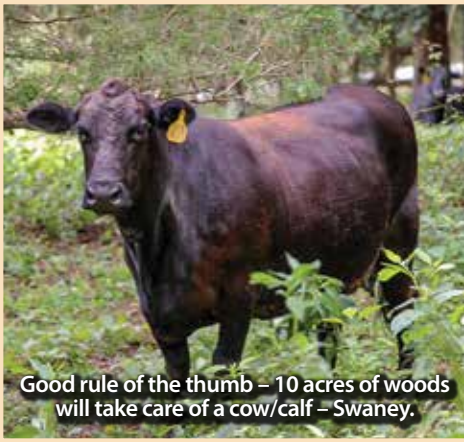
Good rule of the thumb – 10 acres of woods will take care of a cow/calf – Swaney.