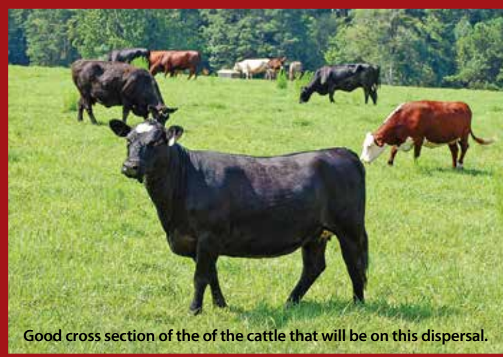
Good cross section of the of the cattle that will be on this dispersal.

Selling (26) cows consist (15) Hereford, (4) Smokes, (4) BWF, (1) Red Poll, medium to large frame, good body condition, gentle, run on fescue pasture, average 1275#, bred to Springfield Angus bull, fall & early winter calving, (2) 2-month old calves @ press time, 4-yr. Springfield Angus bull Sired by E & B Plus1, -2.4 BW, sells also, could be ideal for heifers. This is a complete dispersal. (2) jennies also sell.