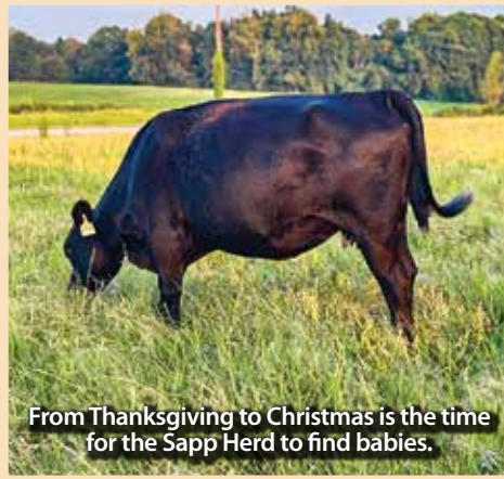
From Thanksgiving to Christmas is the time for the Sapp Herd to find babies.