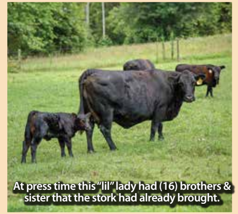
At press time this "lil" lady had (16) brothers & sister that the stork had already brought.