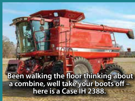
Been walking the floor thinking about a combine, well take your boots off - here is a Case IH 2388.