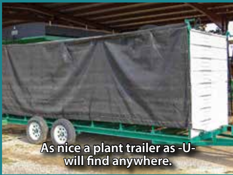
As nice a plant trailer as -U- will find anywhere.