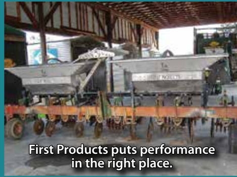
First Products puts performance in the right place.