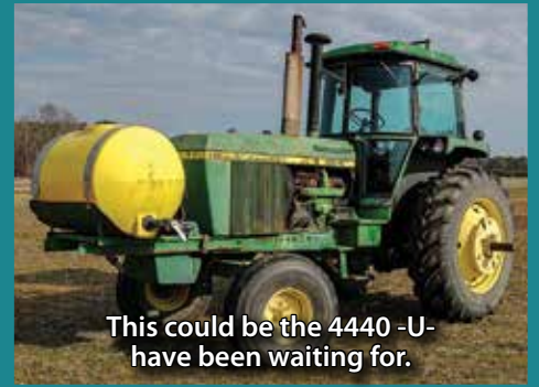
This could be the 4440 -U- have been waiting for.