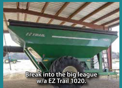
Break into the big league w/a EZ Trail 1020.