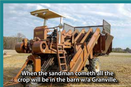
When the sandman cometh all the crop will be in the barn w/a Granville.