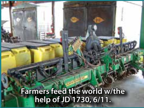
Farmers feed the world w/the help of JD 1730, 6/11.