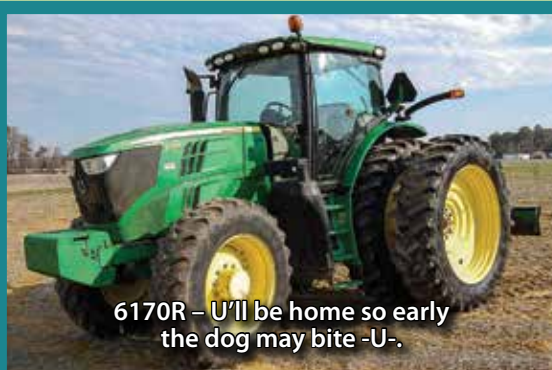
6170R – U'll be home so early the dog may bite -U-.