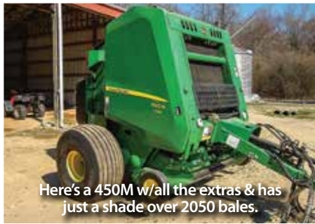
Here's a 450M w/all the extras & has just a shade over 2050 bales.

BID IN PERSON OR ONLINE @ bid.ebharris.com