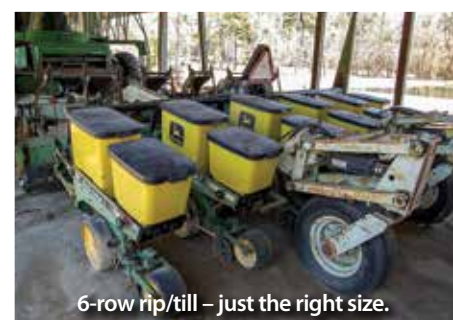
6-row rip/till - just the right size.