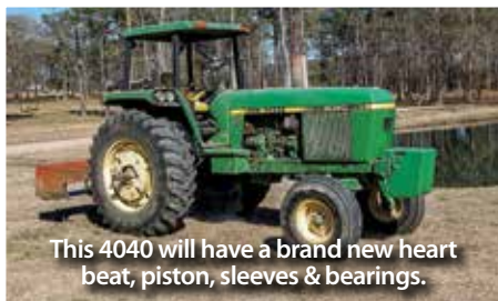
This 4040 will have a brand new heart beat, piston, sleeves & bearings.