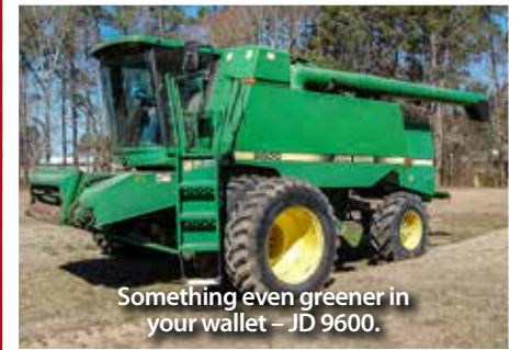
Something even greener in your wallet - JD 9600.