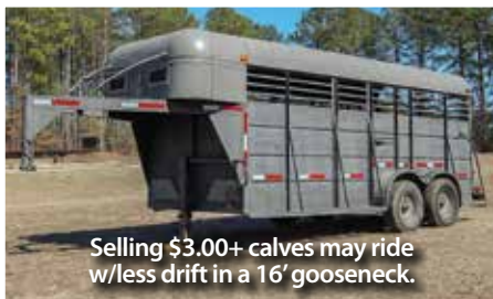
Selling $3.00+ calves may ride w/less drift in a 16' gooseneck.