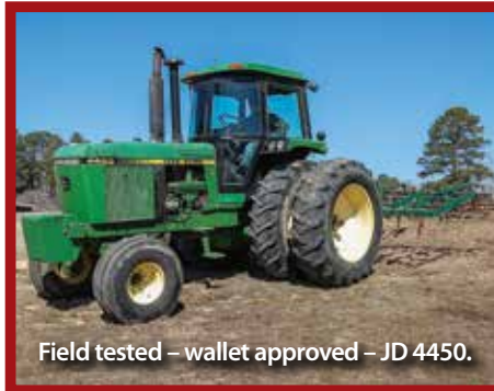
Field tested - wallet approved - JD 4450.

Cat 252C skid steer, 4-cyl. diesel, 4426 hrs., SN-FDG01222.