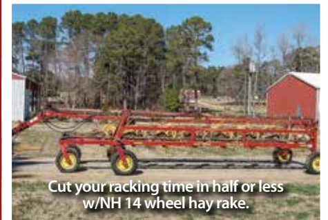
Cut your racking time in half or less w/NH 14 wheel hay rake.