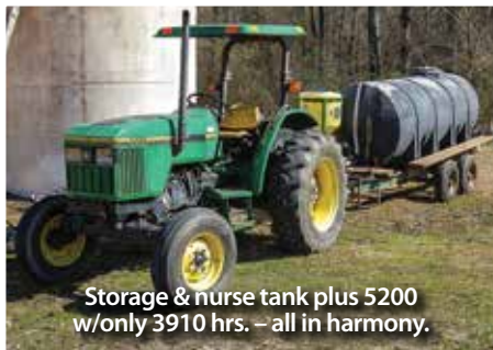
Storage & nurse tank plus 5200 w/only 3910 hrs. - all in harmony.