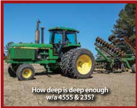
How deep is deep enough w/a 4555 & 235?

SALE SITE ADDRESS: 840 NORTH JOHNSON RD - SMITHFIELD, NC