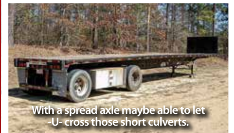
With a spread axle maybe able to let U- cross those short culverts.