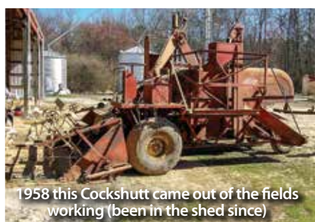
1958 this Cockshutt came out of the fields working (been in the shed since)