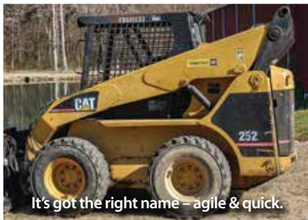
It's got the right name - agile & quick.