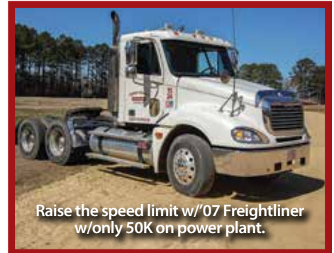
Raise the speed limit w/'07 Freightliner w/only 50K on power plant.

John Deere Mdl. 235 , 18' 48-blade center fold disc, 12" spacing.