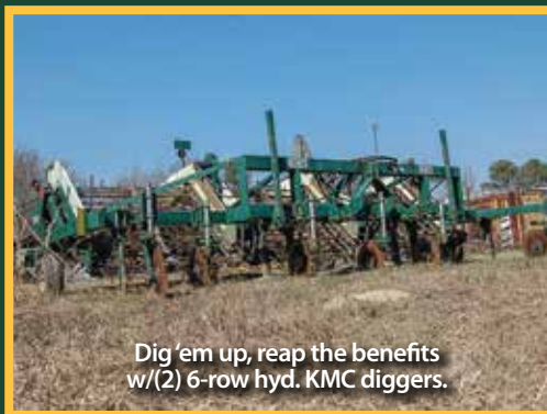
Dig 'em up, reap the benefits w/(2) 6-row hyd. KMC diggers.