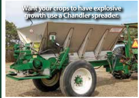
Want your crops to have explosive growth use a Chandler spreader.