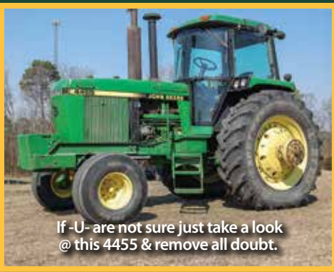
If -U- are not sure just take a look @ this 4455 & remove all doubt.