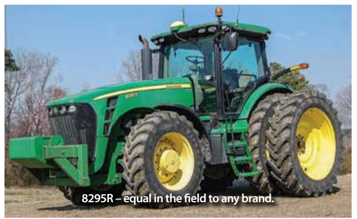
8295R – equal in the field to any brand.