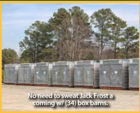
No need to sweat Jack Frost a coming w/ (34) box barns.