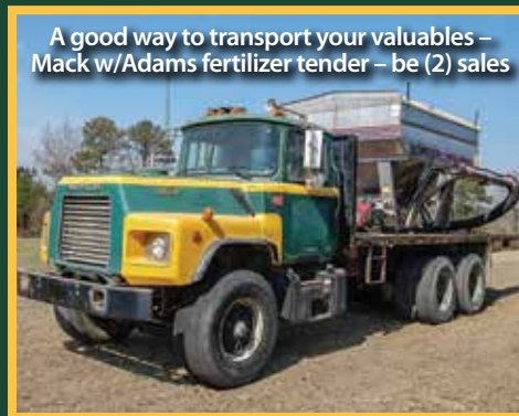
A good way to transport your valuables – Mack w/Adams fertilizer tender – be (2) sales