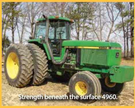
Strength beneath the surface 4960.