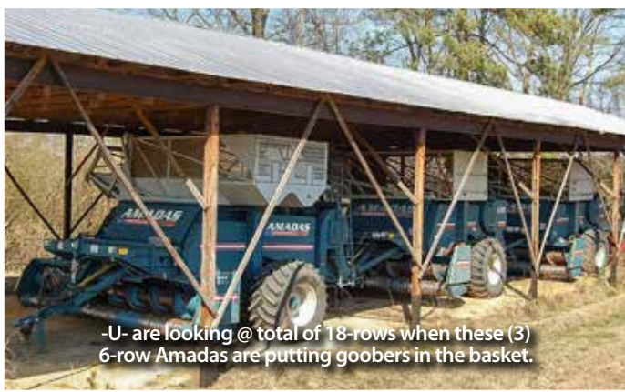
-U- are looking @ total of 18-rows when these (3) 6-row Amadas are putting goobers in the basket.

SALE LOCATION: 30 PINEAPPLE LANE – FUQUAY VARINA, NC