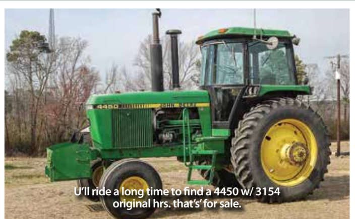
U'll ride a long time to find a 4450 w/ 3154 original hrs. that's for sale.