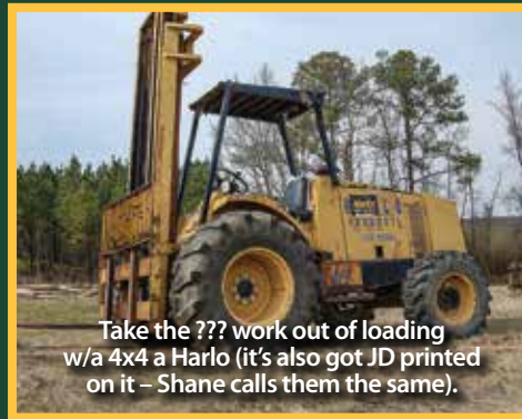
Take the ??? work out of loading w/a 4x4 a Harlo (it's also got JD printed on it – Shane calls them the same).