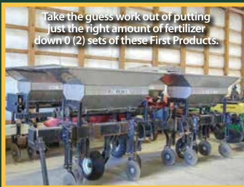
Take the guess work out of putting just the right amount of fertilizer down (2) sets of these First Products.

John Deere 215 , 15'; 40-blade disc, 9" spacing, tandem wheels.