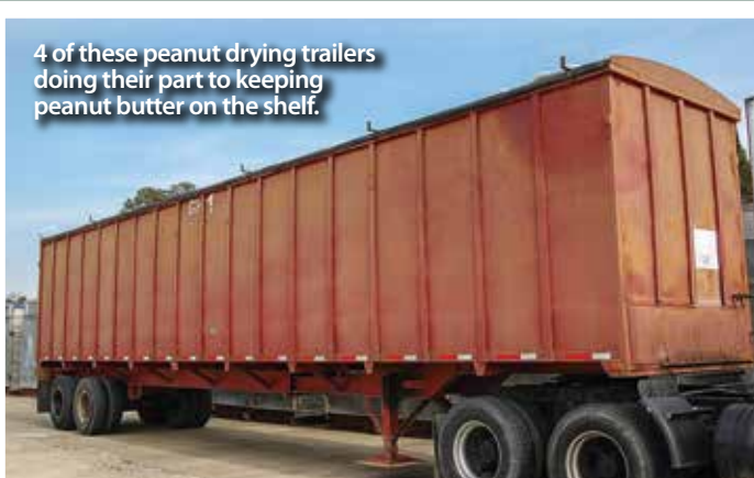
4 of these peanut drying trailers doing their part to keeping peanut butter on the shelf.