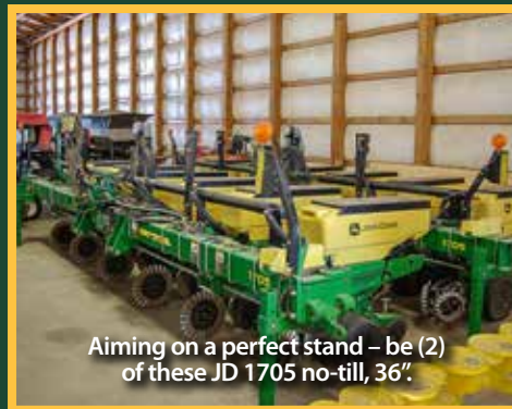
Aiming on a perfect stand – be (2) of these JD 1705 no-till, 36".

Sales Tax Info – We are now required to charge NC Sales Tax at our sales. If you we do not have a completed sales tax exempt on file, you will be charged NC Sales Tax.