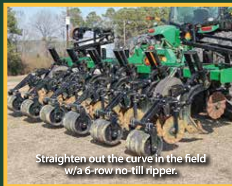
Straighten out the curve in the field w/a 6-row no-till ripper.