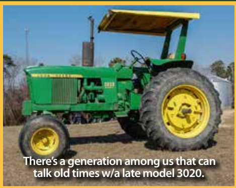
There's a generation among us that can talk old times w/a late model 3020.