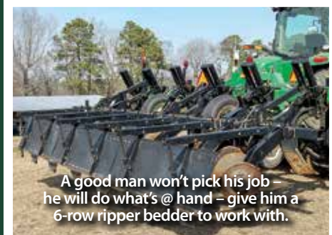
A good man won't pick his job – he will do what's @ hand – give him a 6-row ripper bedder to work with.