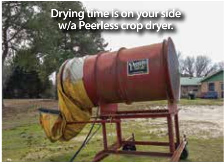
Drying time is on your side w/a Peerless crop dryer.