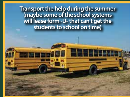
Transport the help during the summer (maybe some of the school systems will lease form -U- that can't get the students to school on time)