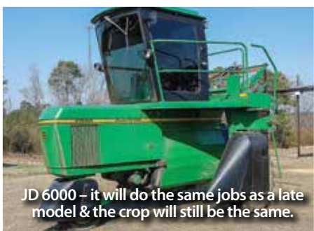
JD 6000 – it will do the same jobs as a late model & the crop will still be the same.