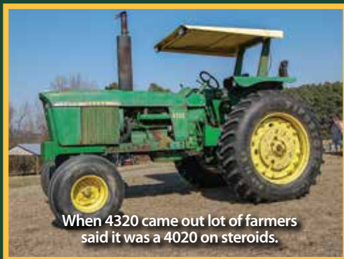
When 4320 came out lot of farmers said it was a 4020 on steroids.