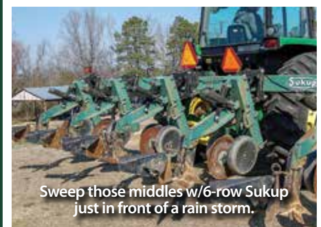
Sweep those middles w/6-row Sukup just in front of a rain storm.