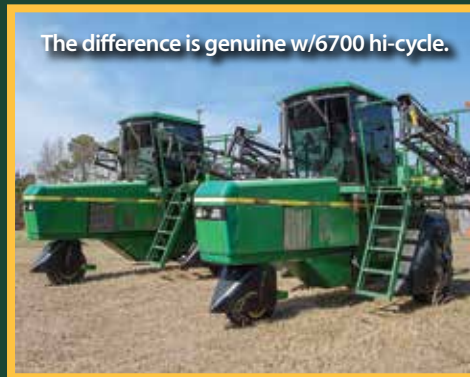
The difference is genuine w/6700 hi-cycle.