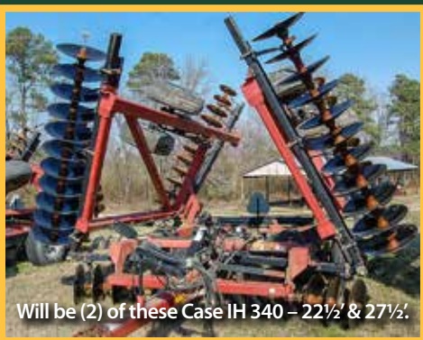
Will be (2) of these Case IH 340 - 22 1/2' & 27 1/2'.