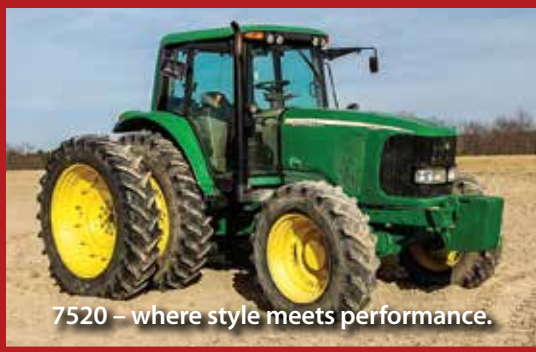
7520 – where style meets performance.