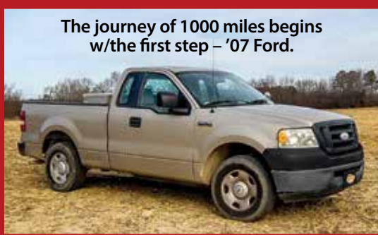
The journey of 1000 miles begins w/the first step – '07 Ford.