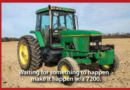
Waiting for something to happen - make it happen w/a 7200.