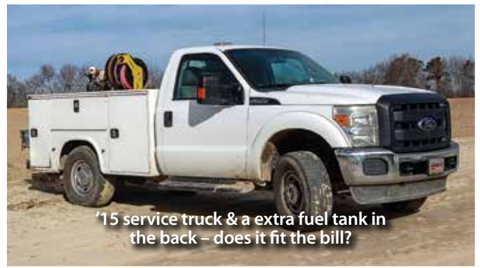
'15 service truck & a extra fuel tank in the back – does it fit the bill?