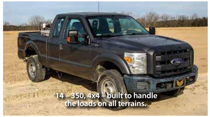
'14 – 350, 4x4 – built to handle the loads on all terrains.