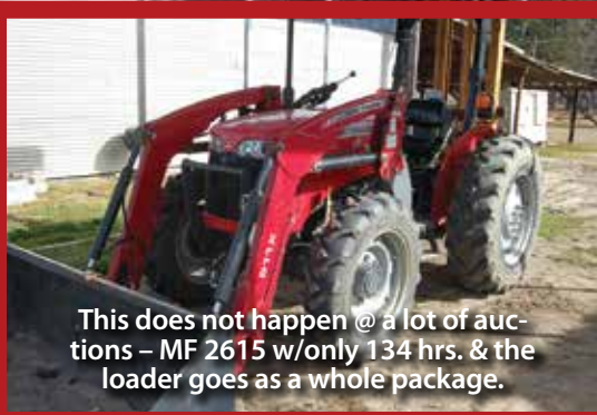
This does not happen @ a lot of auctions – MF 2615 w/only 134 hrs. & the loader goes as a whole package.