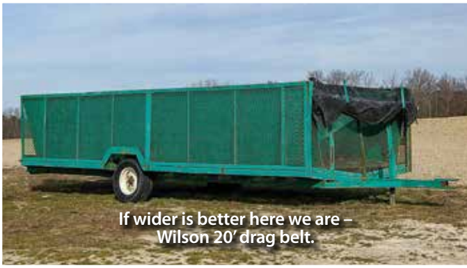
If wider is better here we are – Wilson 20' drag belt.