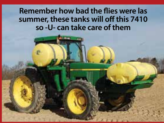
Remember how bad the flies were last summer, these tanks will off this 7410 so -U- can take care of them