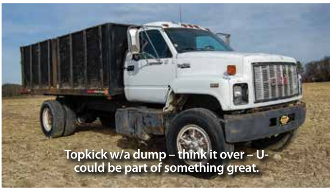
Topkick w/a dump – think it over – U- could be part of something great.