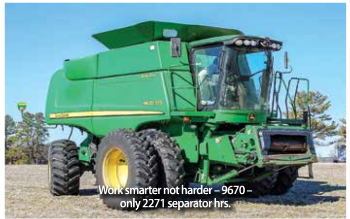
Work smarter not harder – 9670 – only 2271 separator hrs.