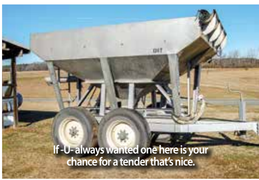
If -U- always wanted one here is your chance for a tender that's nice.