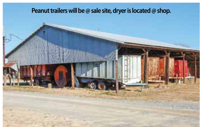
Peanut trailers will be @ sale site, dryer is located @ shop.