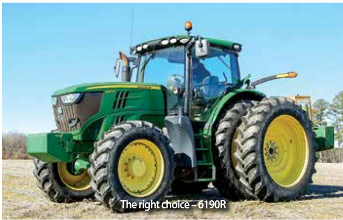
The right choice – 6190R