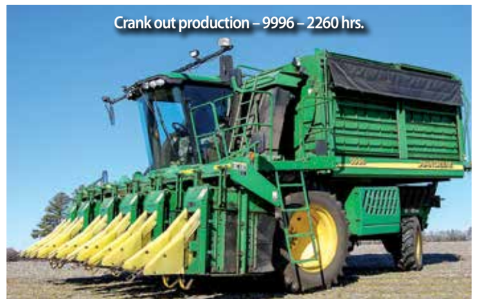
Crank out production – 9996 – 2260 hrs.