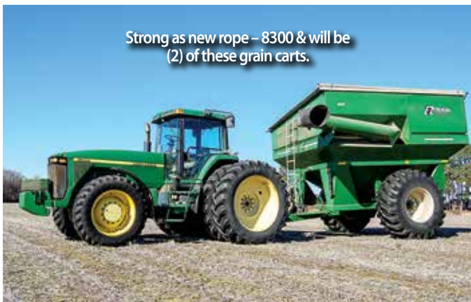
Strong as new rope – 8300 & will be (2) of these grain carts.