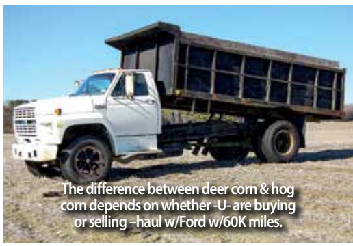
The difference between deer corn & hog corn depends on whether -U- are buying or selling—haul w/Ford w/60K miles.