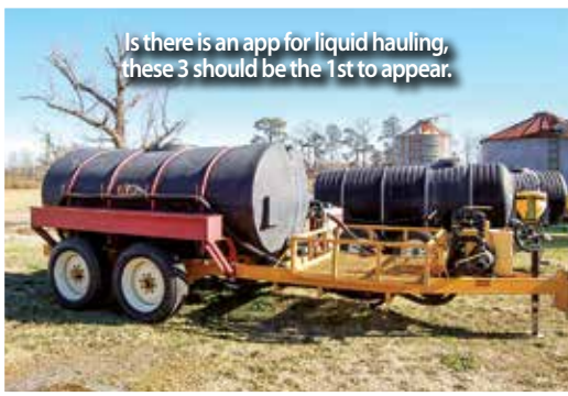
Is there is an app for liquid hauling, these 3 should be the 1st to appear.