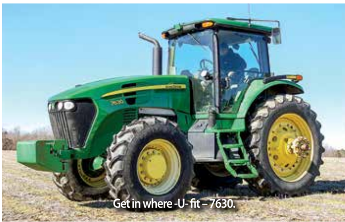
Get in where -U- fit – 7630.