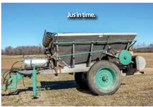
Jus in time.