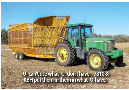
-U- can't use what -U- don't have - 7810 & KBH put them in them in what -U- have.