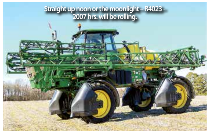
Straight up noon or the moonlight – R4023 - 2007 hrs. will be rolling.