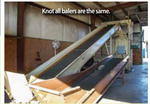
Knot all balers are the same.

For more info call Hal @ 252-395-1631 or Steven @ 252-287-2897