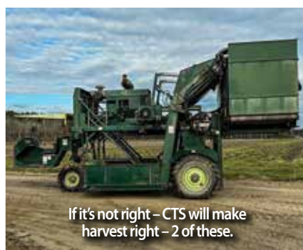
If it's not right – CTS will make harvest right – 2 of these.