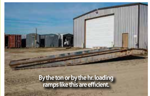
By the ton or by the hr. loading ramps like this are efficient.