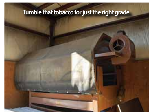
Tumble that tobacco for just the right grade.