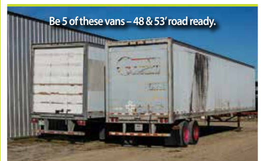
Be 5 of these vans – 48 & 53' road ready.