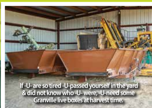
If -U- are so tired -U- passed yourself in the yard & did not know who -U- were, -U- need some Granville live boxes at harvest time.