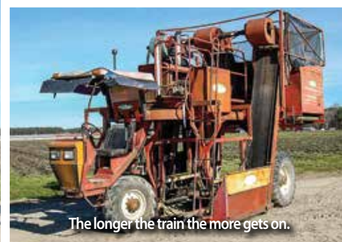
The longer the train the more gets on.