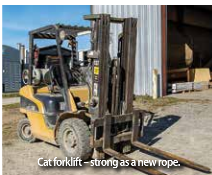
Cat forklift – strong as a new rope.

(20) Tobacco box screens for Long barns.