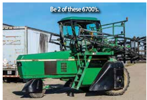
Be 2 of these 6700's.