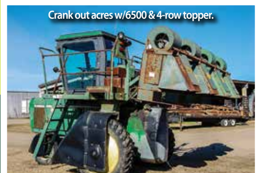
Crank out acres w/6500 & 4-row topper.