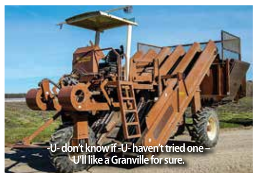
U- don't know if U- haven't tried one – U'll like a Granville for sure.