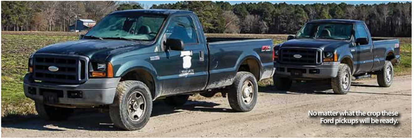
No matter what the crop these Ford pickups will be ready.

COME IN PERSON & ENJOY THE LIVE AUCTION OR CLICK THAT BUTTON & BID LIVE TIME