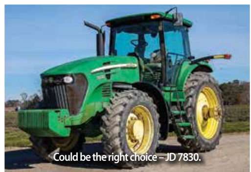
Could be the right choice – JD 7830.