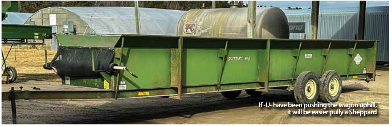
If-U- have been pushing the wagon uphill, it will be easier pully a Sheppard