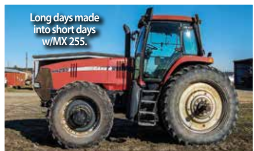
Long days made into short days w/MX 255.