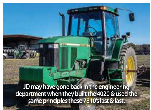
JD may have gone back in the engineering department when they built the 4020 & used the same principles these 7810's last & last.