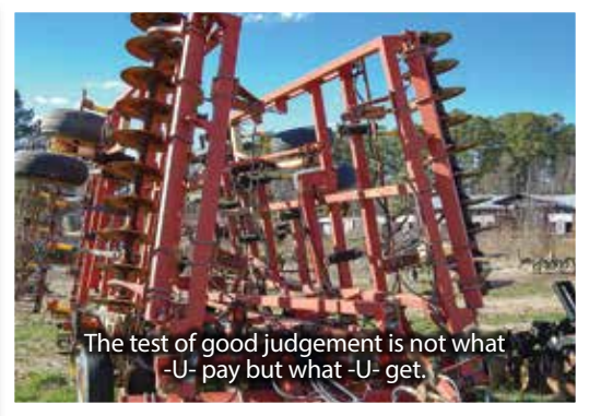
The test of good judgement is not what -U- pay but what -U- get.

Sales Tax Info – We are now required to charge NC Sales Tax at our sales. If we do not have a completed sales tax exempt on file, you will be charged NC Sales Tax.