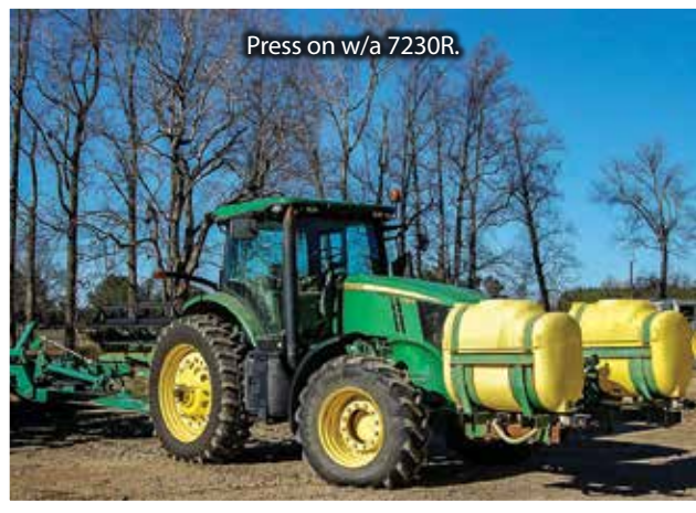
Press on w/a 7230R.