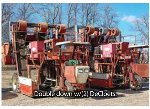
Double down w/(2) DeCloets.