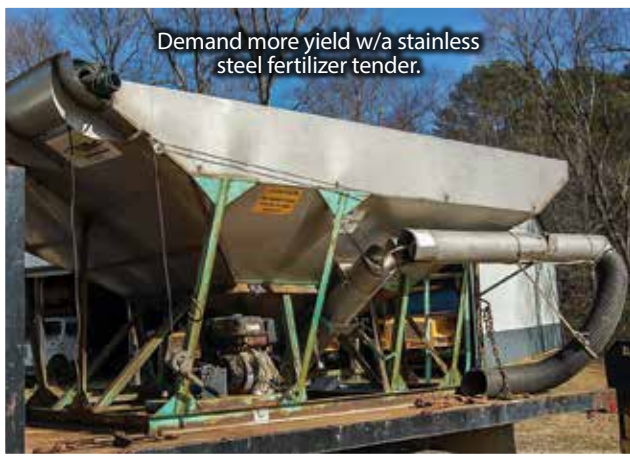
Demand more yield w/a stainless steel fertilizer tender.