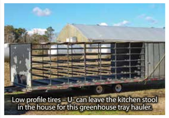
Low profile tires – U- can leave the kitchen stool in the house for this greenhouse tray hauler.