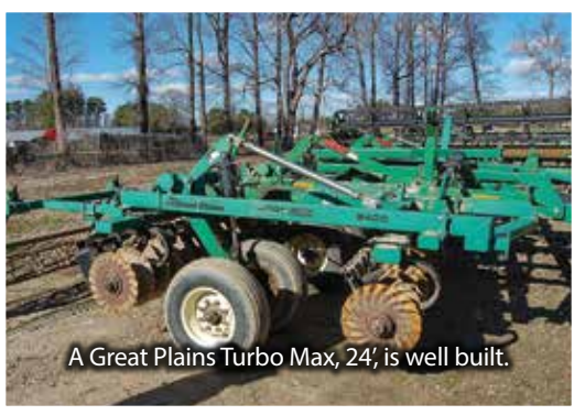
A Great Plains Turbo Max, 24', is well built.