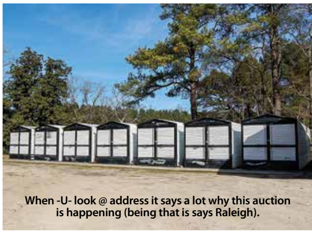
When -U- look @ address it says a lot why this auction is happening (being that it says Raleigh).