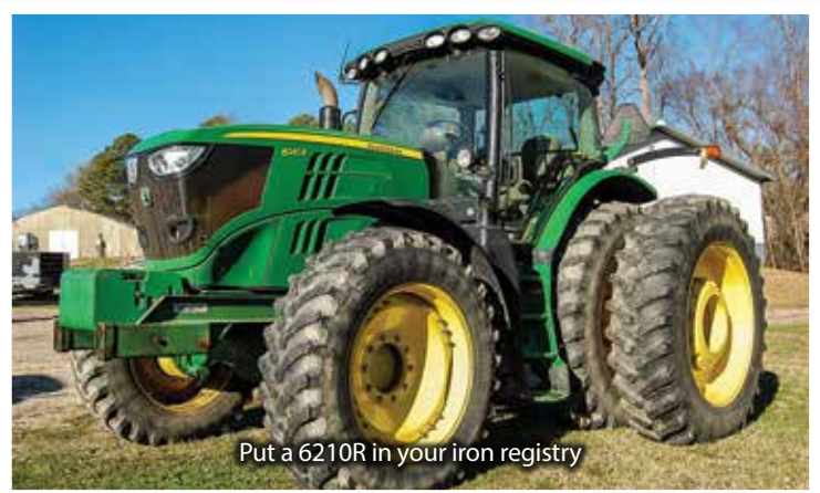
Put a 6210R in your iron registry