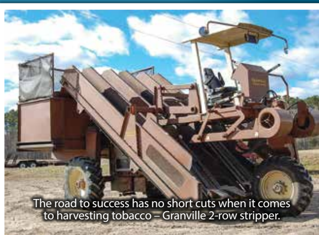
The road to success has no short cuts when it comes to harvesting tobacco – Granville 2-row stripper.