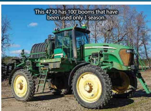
This 4730 has 100' booms that have been used only 1 season.