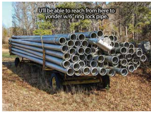
U'll be able to reach from here to yonder w/6" ring lock pipe.