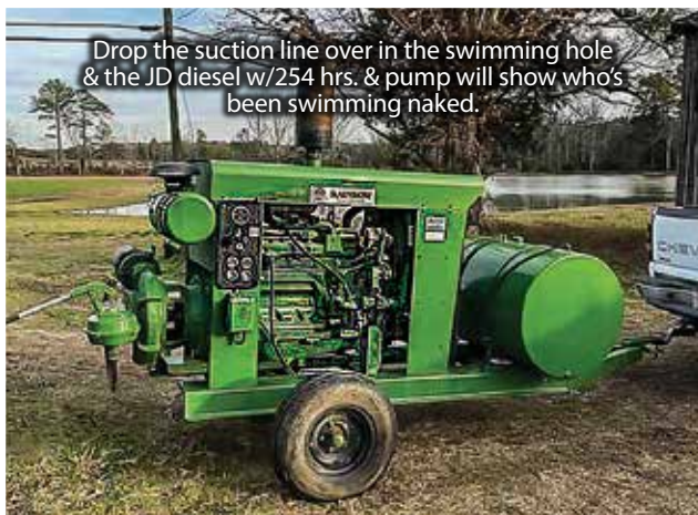
Drop the suction line over in the swimming hole & the JD diesel w/254 hrs. & pump will show who's been swimming naked.