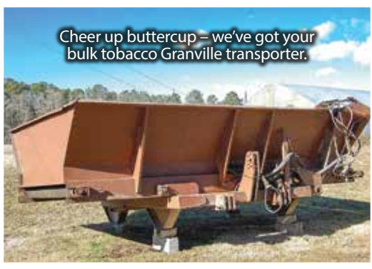
Cheer up buttercup – we've got your bulk tobacco Granville transporter.