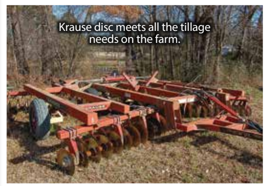
Krause disc meets all the tillage needs on the farm.