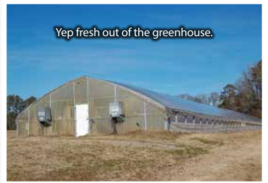
Yep fresh out of the greenhouse.