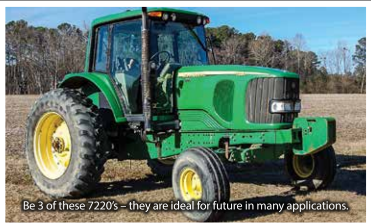
Be 3 of these 7220's – they are ideal for future in many applications.