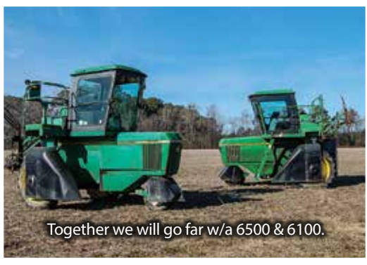
Together we will go far w/a 6500 & 6100.