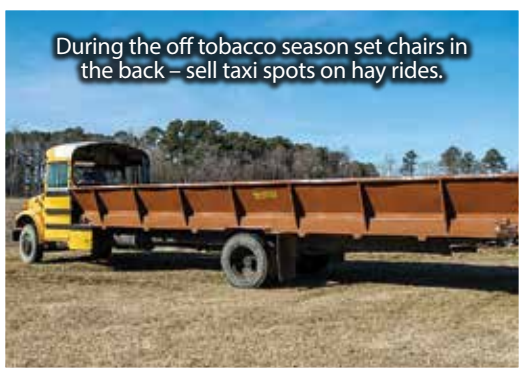
During the off tobacco season set chairs in the back – sell taxi spots on hay rides.