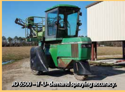
JD 6500 - if -U- demand spraying accuracy.