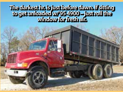
The darkest hr. is just before dawn. If sitting to get unloaded w/95 4900 – just roll the window for fresh air.