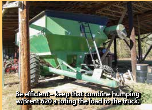
Be efficient - Keep that combine humping w/Brent 620 a toting the load to the truck.