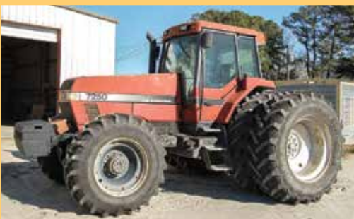
When the pressure is on make sure this 7250 is the heavy hitting line.