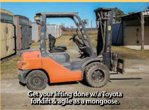
Get your lifting done w/a Toyota forklift & agile as a mongoose.