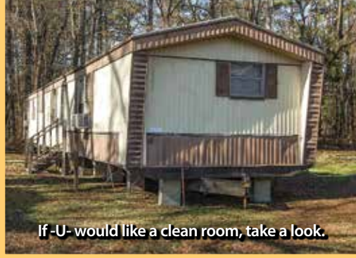
If -U- would like a clean room, take a look.