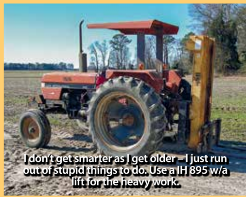
I don't get smarter as I get older - I just run out of stupid things to do. Use a IH 895 w/a lift for the heavy work.

SALES TAX INFO We are now required to charge NC Sales Tax at our sales. If you we do not have a completed sales tax exempt on file, you will be charged NC Sales Tax