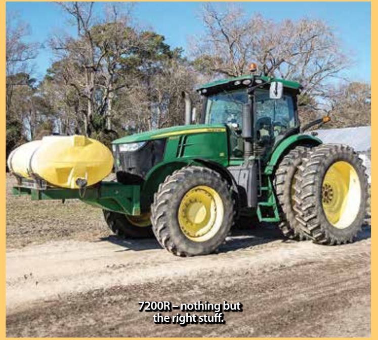
7200R – nothing but the right stuff.