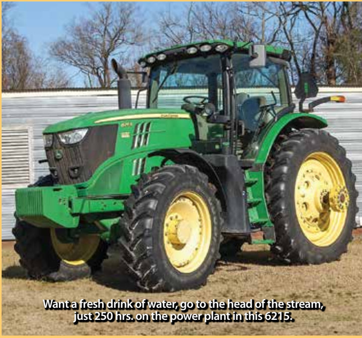
Want a fresh drink of water, go to the head of the stream, just 250 hrs. on the power plant in this 6215.

SALE SITE ADDRESS: 2027 Hugo Rd. – Kinston, NC