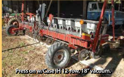
Press on w/Case IH 12-row, 18" vacuum.