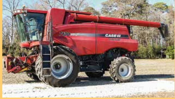
Get threshing work done w/Case IH 7130.