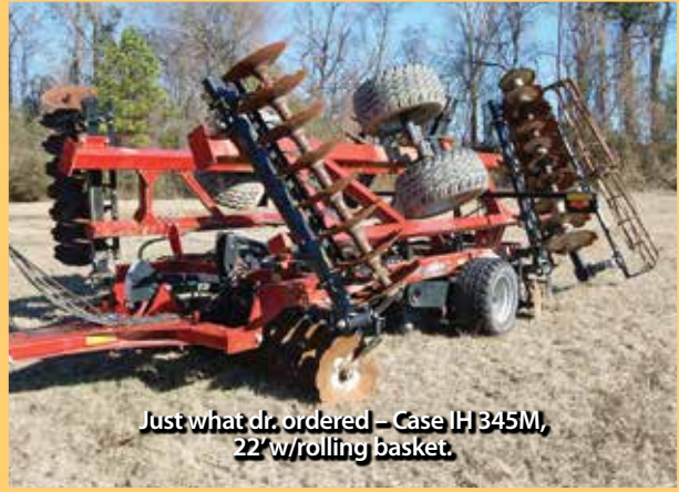
Just what dr. ordered - Case IH 345M, 22' w/rolling basket.

EQUIPMENT THAT EXCEEDS ALL EXPECTATIONS!