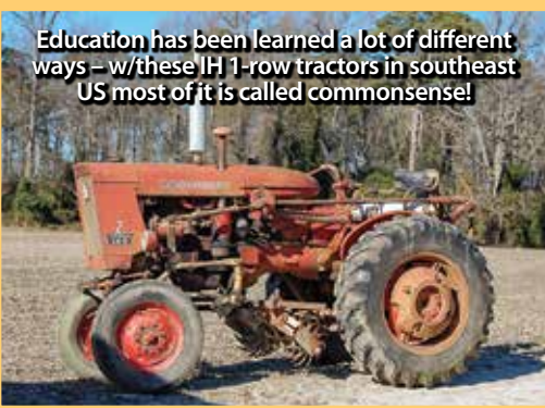
Education has been learned a lot of different ways – w/these IH 1-row tractors in southeast US most of it is called commonsense!