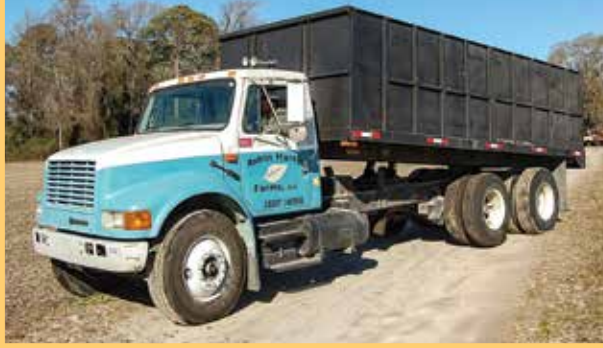
2001 that saves on tires w/a front tandem that lifts.