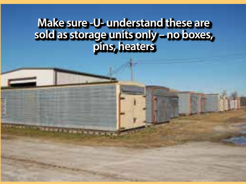
Make sure -U- understand these are sold as storage units only – no boxes, pins, heaters