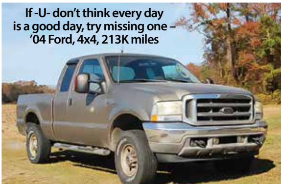
If-U- don't think every day is a good day, try missing one – '04 Ford, 4x4, 213K miles