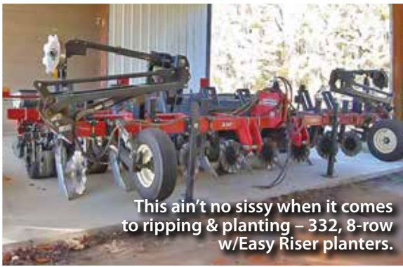
This ain't no sissy when it comes to ripping & planting – 332, 8-row w/Easy Riser planters.