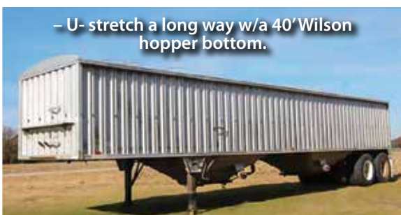
– U- stretch a long way w/a 40' Wilson hopper bottom.