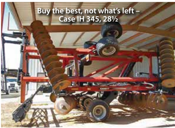
Buy the best, not what's left – Case IH 345, 28½'