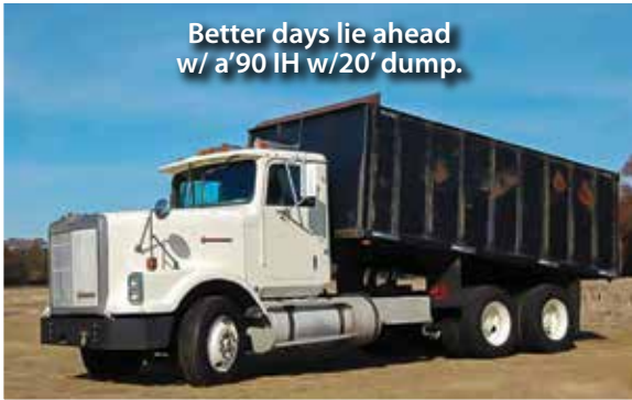
Better days lie ahead w/ a'90 IH w/20' dump.