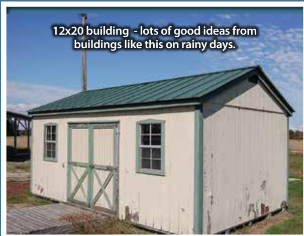
12x20 building - lots of good ideas from buildings like this on rainy days.

Bid in person or online @ bid.ebharris.com