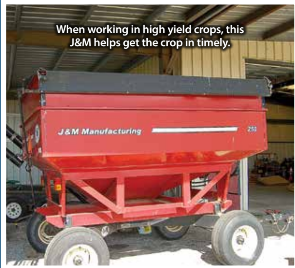
When working in high yield crops, this J&M helps get the crop in timely.

3' boom pole. 1000 gal. fuel tank w/electric pump. 100 gal. square fuel tank w/battery operated pump. John Deere suitcase weight (thin). Bolt bins. Hand tools. John Deere planter plates, (12) corn, (12) soybean. Fence insulators. Hand held post driver, for small post like fiberglass post. Cattle show halters. Mule hanes. Cotton scales. Steel wagon wheels. Anvil w/broke horn. (8) 14.5 new tires mounted on rims.