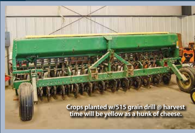
Crops planted w/515 grain drill @ harvest time will be yellow as a hunk of cheese.