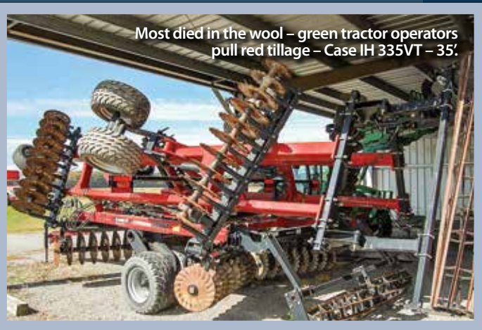
Most died in the wool – green tractor operators pull red tillage – Case IH 335VT – 35'