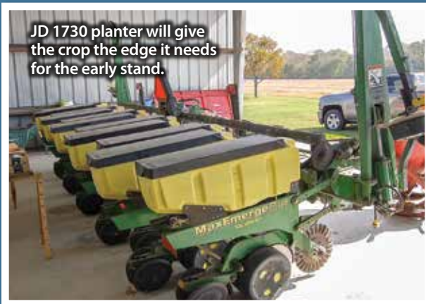
JD 1730 planter will give the crop the edge it needs for the early stand.

Sales Tax Info – We are now required to charge NC Sales Tax at our sales. If we do not have a completed sales tax exempt on file, you will be charged NC Sales Tax.