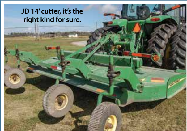
JD 14' cutter, it's the right kind for sure.