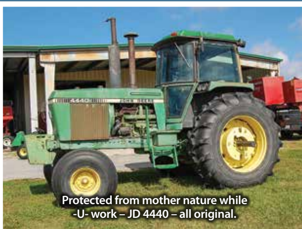
Protected from mother nature while -U- work – JD 4440 – all original.

The reason this GMC looks as sharp as it does is because of the driver that's in the picture.