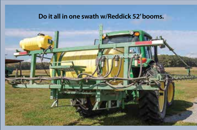
Do it all in one swath w/Reddick 52' booms.