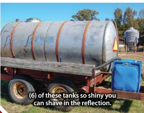
(6) of these tanks so shiny you can shave in the reflection.