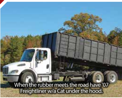
When the rubber meets the road have '07 Freightliner w/a Cat under the hood.