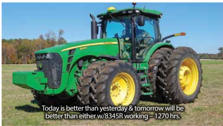
Today is better than yesterday & tomorrow will be better than either w/8345R working – 1270 hrs.

Note: When driving up to sale site, Milton asked if -U- would drive all the way up to the shop & then turn into sale site. He ask not to park on grass under pecan trees or drive across grass. Thank you in advance for your cooperation.