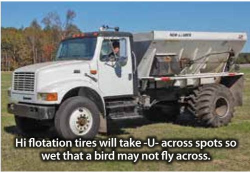
Hi flotation tires will take -U- across spots so wet that a bird may not fly across.