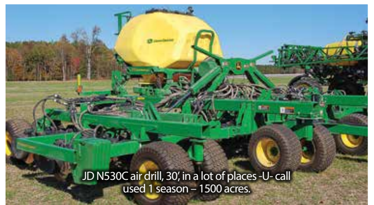
JD N530C air drill, 30', in a lot of places -U- call used 1 season – 1500 acres.