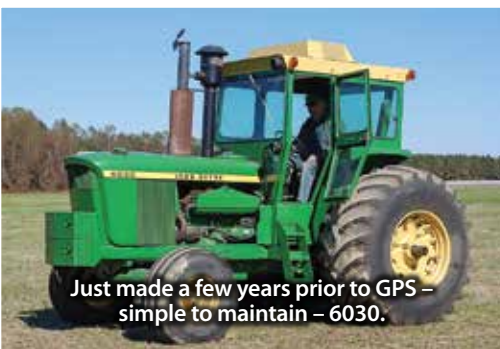
Just made a few years prior to GPS - simple to maintain - 6030.