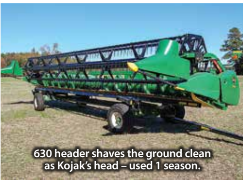
630 header shaves the ground clean as Kojak's head - used 1 season.