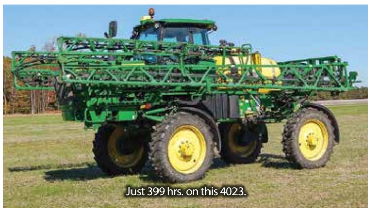
Just 399 hrs. on this 4023.