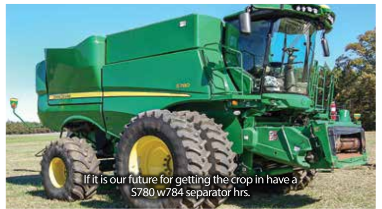
If it is our future for getting the crop in have a S780 w784 separator hrs.