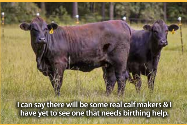
I can say there will be some real calf makers & I have yet to see one that needs birthing help.