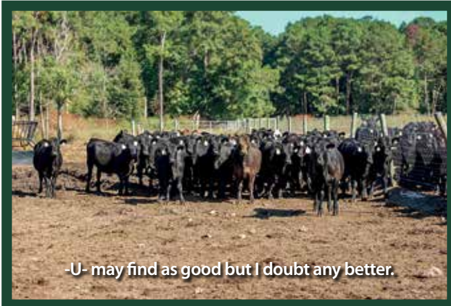
-U- may find as good but I doubt any better.

SALE SITE ADDRESS: 93 Agriculture Way – Clinton, NC 28328