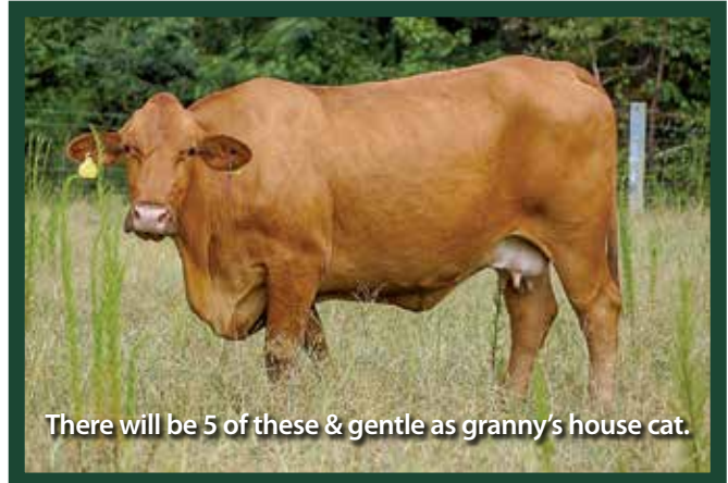
There will be 5 of these & gentle as granny's house cat.