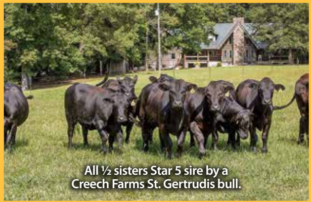
All ½ sisters Star 5 sire by a Creech Farms St. Gertrudis bull.