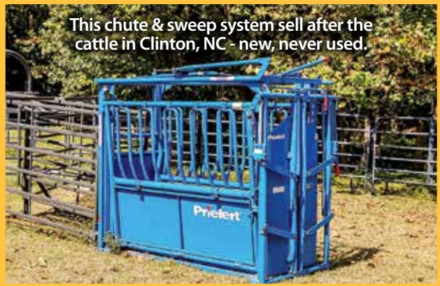
This chute & sweep system sell after the cattle in Clinton, NC - new, never used.