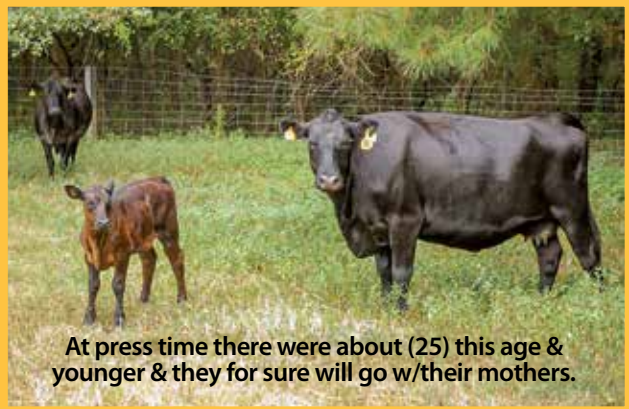
At press time there were about (25) this age & younger & they for sure will go w/their mothers.