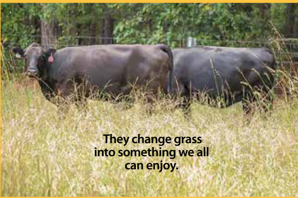
They change grass into something we all can enjoy.