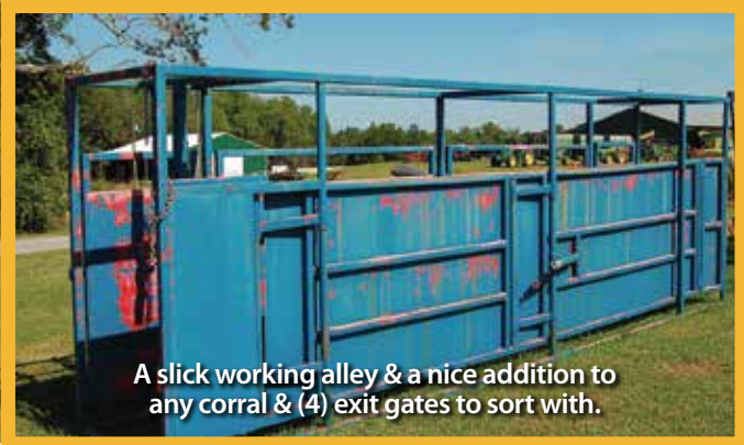
A slick working alley & a nice addition to any corral & (4) exit gates to sort with.

Inspection: October 16 – 26 – 8:00 am – 5:00 pm. Visit ebharris.com for more details & photos.