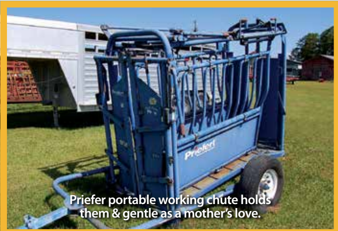
Priefert portable working chute holds them & gentle as a mother's love.