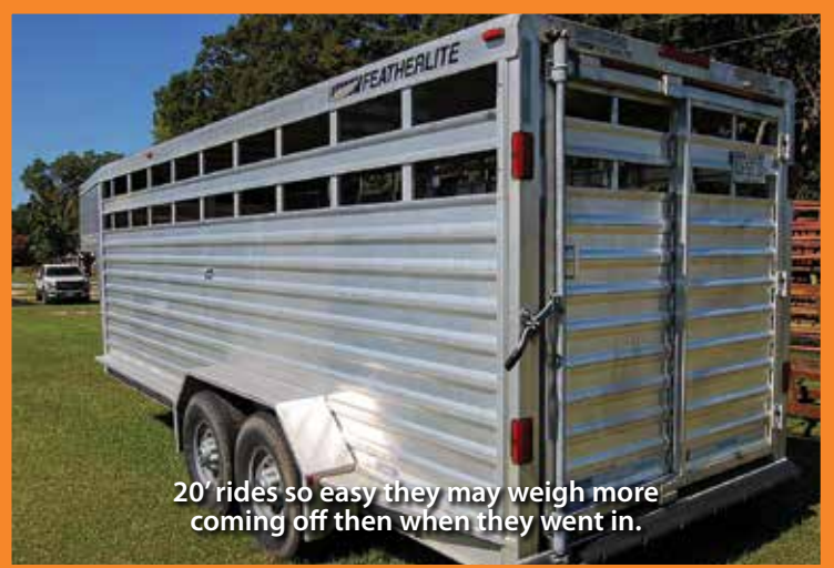
20' rides so easy they may weigh more coming off then when they went in.