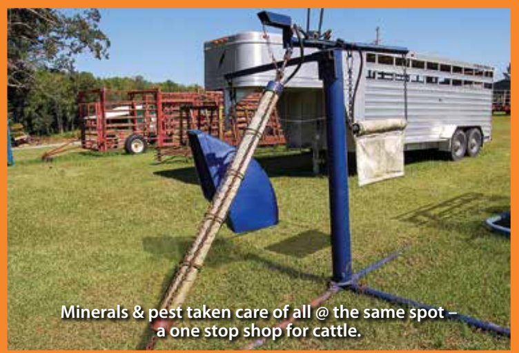
Minerals & pest taken care of all @ the same spot – a one stop shop for cattle.