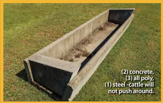
(2) concrete, (3) all poly, (1) steel -cattle will not push around.