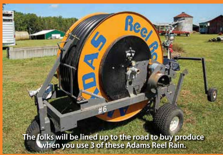
The folks will be lined up to the road to buy produce when you use 3 of these Adams Reel Rain.