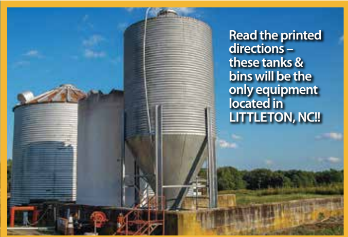
Read the printed directions – these tanks & bins will be the only equipment located in LITTLETON, NC!!