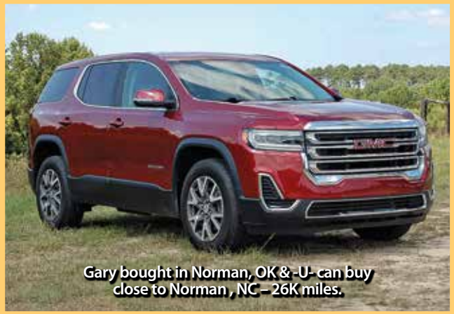
Gary bought in Norman, OK & -U- can buy close to Norman, NC - 26K miles.

And just think @ it all sells @ AUCTION!!!