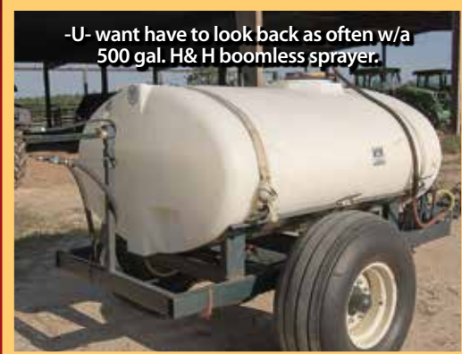
-U- want have to look back as often w/a 500 gal. H & H boomless sprayer.