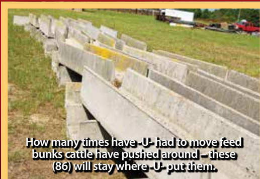
How many times have -U- had to move feed bunks cattle have pushed around - these (86) will stay where -U- put them.