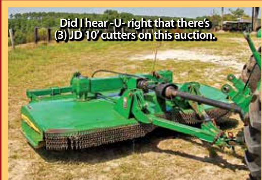
Did I hear -U- right that there's (3) JD 10' cutters on this auction.