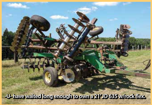
-U- have waited long enough to own a 21' JD 635 w/rock flex.