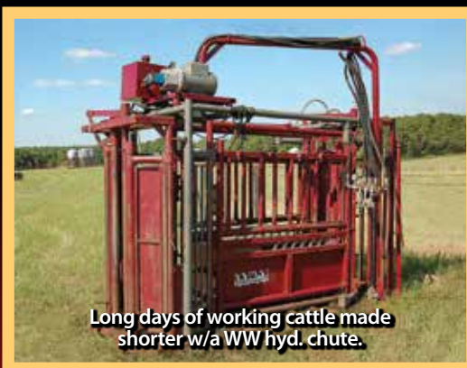
Long days of working cattle made shorter w/a WW hyd. chute.

TERMS & CONDITIONS: All purchases must be paid for sale day. All property sells as is where is with all faults, with absolutely no warranties implied or expressed in any way. All Serial Numbers, mileage & hrs. unverified. All info printed in brochure is believed to be correct but not guaranteed. The auction company reserves the right to offer property in separate sales, combinations thereof or as a whole.