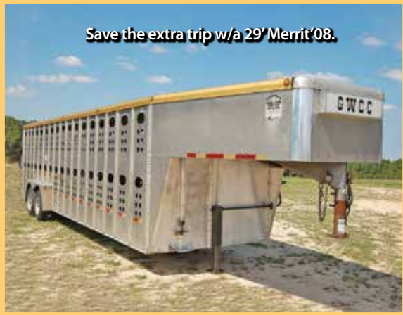
Save the extra trip w/a 29' Merritt 08.