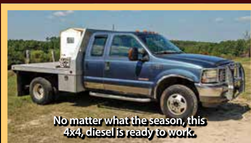
No matter what the season, this 4x4, diesel is ready to work.