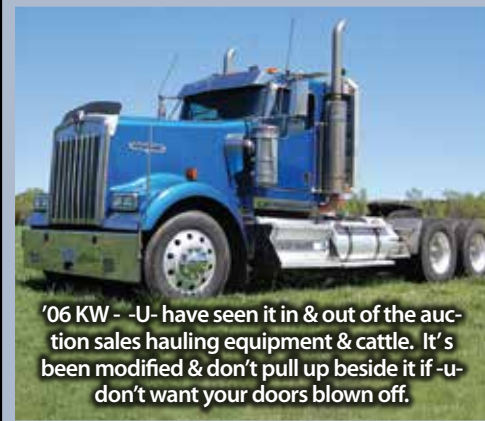
'06 KW - U- have seen it in & out of the auction sales hauling equipment & cattle. It's been modified & don't pull up beside it if -u- don't want your doors blown off.