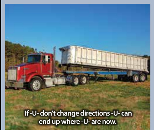
If -U- don't change directions -U- can end up where -U- are now.