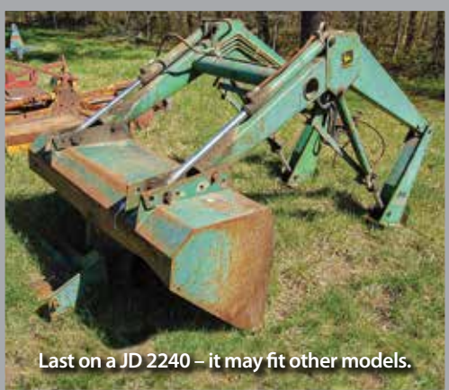
Last on a JD 2240 – it may fit other models.