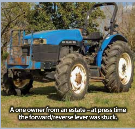
A one owner from an estate – at press time the forward/reverse lever was stuck.