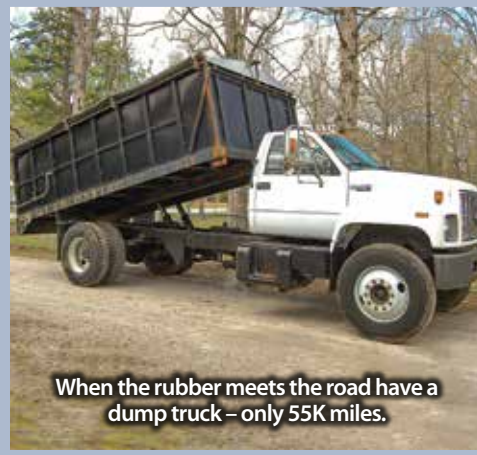
When the rubber meets the road have a dump truck – only 55K miles.