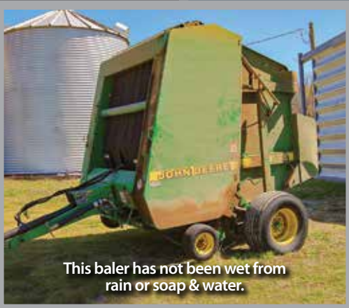
This baler has not been wet from rain or soap & water.

Large inventory of gates & panels coming from dairy closeout.