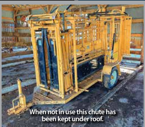
When not in use this chute has been kept under roof.