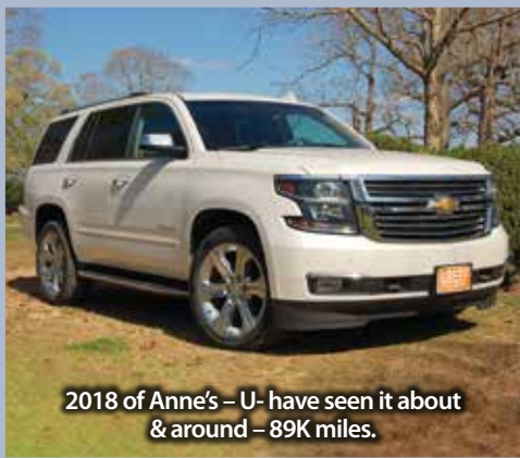
2018 of Anne's - U- have seen it about & around - 89K miles.

SALE SITE ADDRESS: 2254 Hwy. 58 - Warrenton, NC 27589