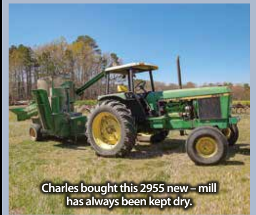
Charles bought this 2955 new - mill has always been kept dry.