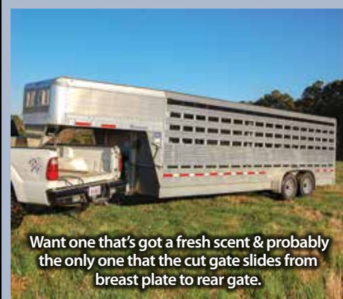
Want one that's got a fresh scent & probably the only one that the cut gate slides from breast plate to rear gate.