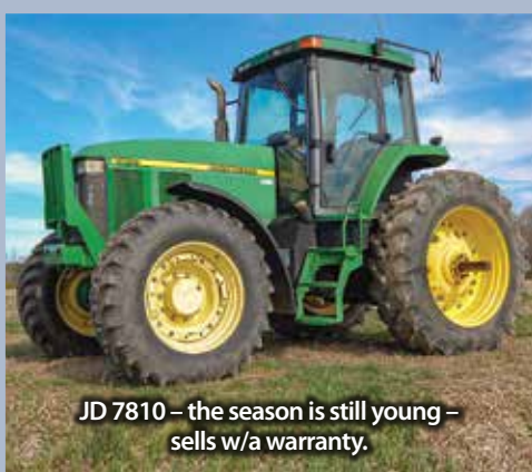
JD 7810 - the season is still young - sells w/a warranty.