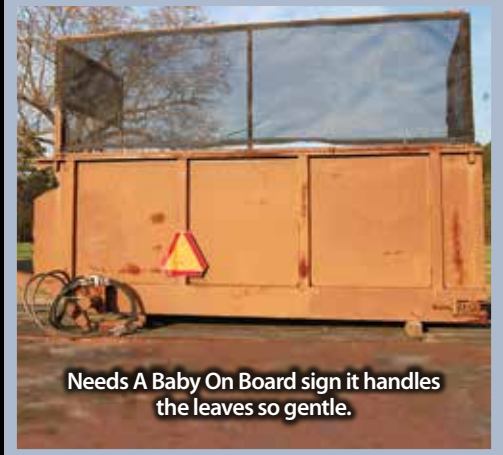
Needs A Baby On Board sign it handles the leaves so gentle.