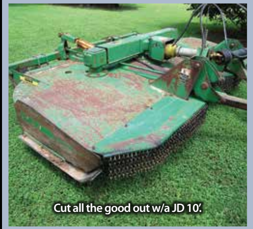
Cut all the good out w/a JD 10'