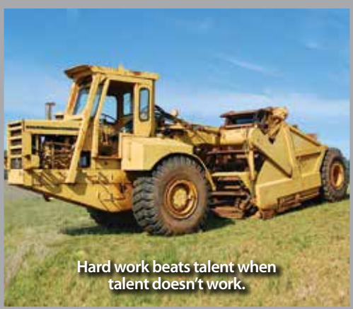
Hard work beats talent when talent doesn't work.