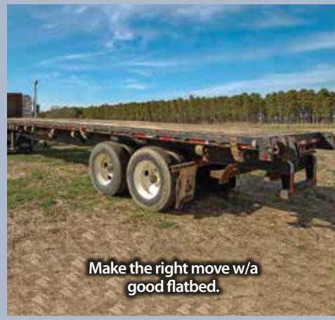
Make the right move w/a good flatbed.