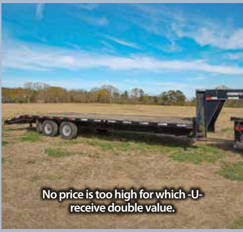
No price is too high for which -U- receive double value.