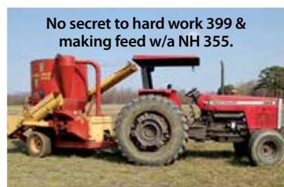
No secret to hard work 399 & making feed w/a NH 355.