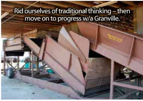
Rid ourselves of traditional thinking - then move on to progress w/a Granville.