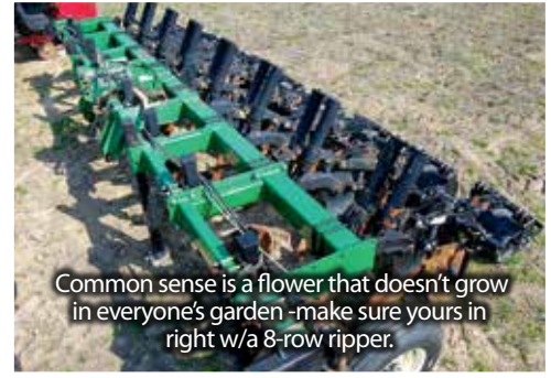
Common sense is a flower that doesn't grow in everyone's garden -make sure yours is right w/a 8-row ripper.