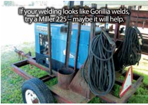
If your welding looks like Gorilla welds, try a Miller 225 - maybe it will help.