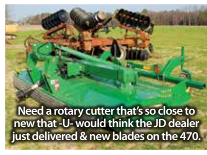
Need a rotary cutter that's so close to new that -U- would think the JD dealer just delivered & new blades on the 470.