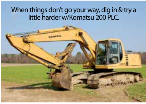
When things don't go your way, dig in & try a little harder w/Komatsu 200 PLC.