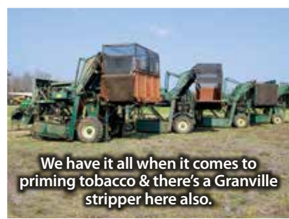
We have it all when it comes to priming tobacco & there's a Granville stripper here also.