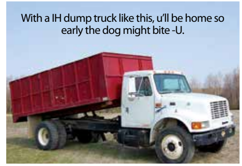
With a IH dump truck like this, u'll be home so early the dog might bite -U.