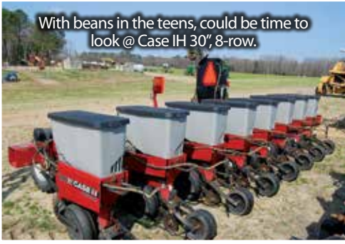
With beans in the teens, could be time to look @ Case IH 30", 8-row.