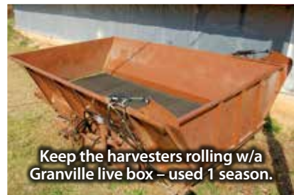
Keep the harvesters rolling w/a Granville live box - used 1 season.