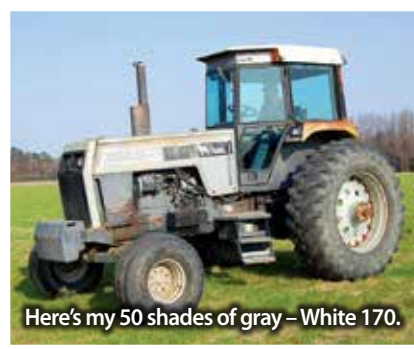
Here's my 50 shades of gray - White 170.