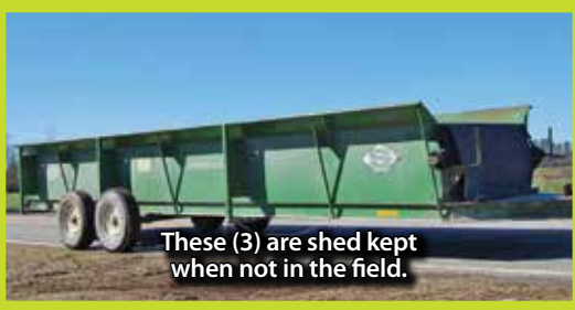
These (3) are shed kept when not in the field.