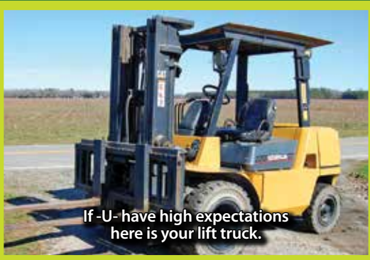
If -U- have high expectations here is your lift truck.