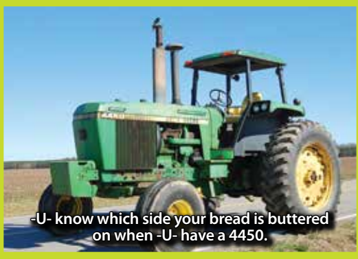
-U- know which side your bread is buttered on when -U- have a 4450.