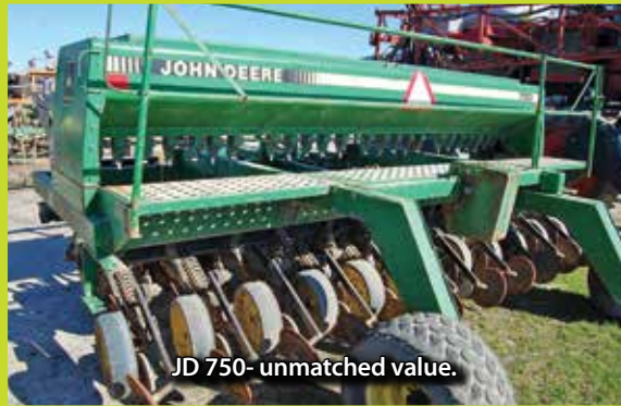
JD 750- unmatched value.