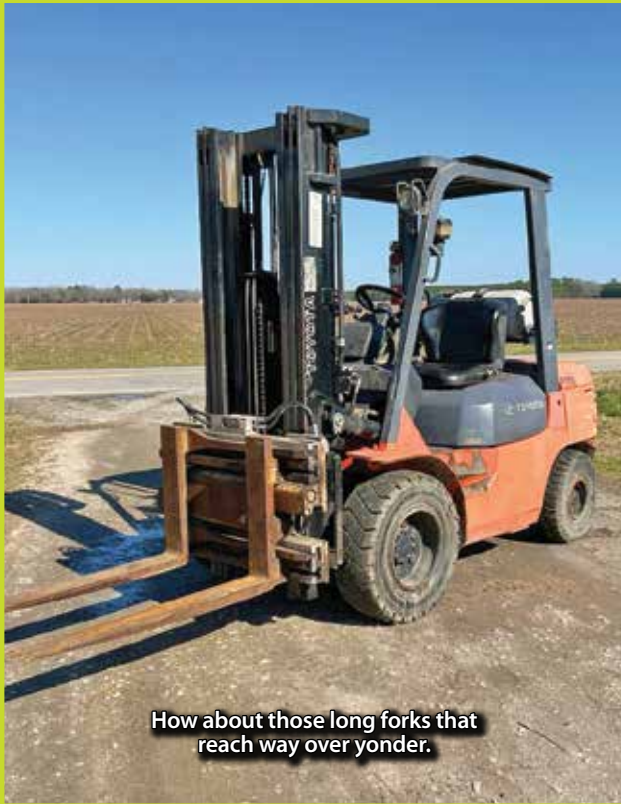
How about those long forks that reach way over yonder.