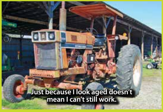
Just because I look aged doesn't mean I can't still work.