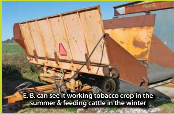
E. B. can see it working tobacco crop in the summer & feeding cattle in the winter