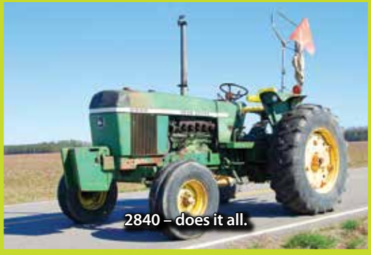
2840 – does it all.