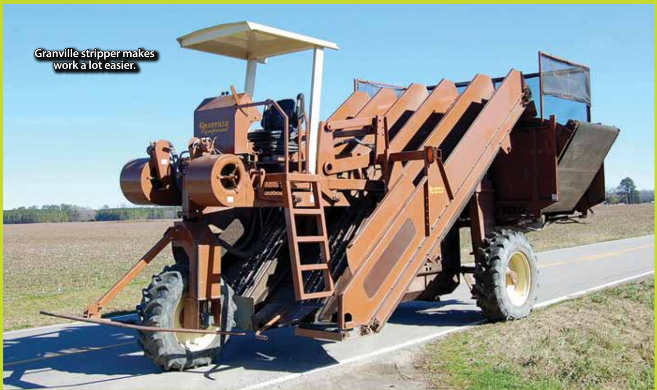
Granville stripper makes work a lot easier.

SALE SITE ADDRESS: 4442 Kehukee Church Rd. – Scotland Neck, NC