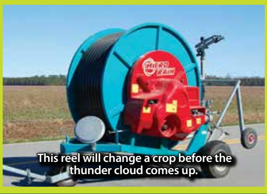
This reel will change a crop before the thunder cloud comes up.

Sales Tax Info – We are now required to charge NC Sales Tax at our sales. If you we do not have a completed sales tax exempt on file, you will be charged NC Sales Tax.