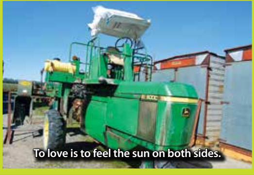
To love is to feel the sun on both sides.