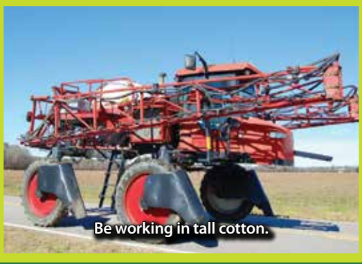
Be working in tall cotton.