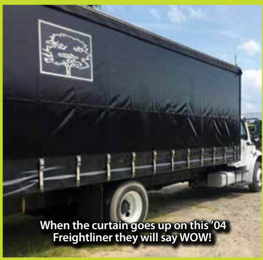
When the curtain goes up on this '04 Freightliner they will say WOW!