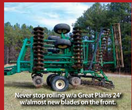
Never stop rolling w/a Great Plains 24' w/almost new blades on the front.

KMC 8-row vertical fold tool bar w/Holland finger setters, gauge wheels, set on 46".