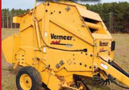
The man that invented the round baler needs an extra biscuit.

2004 White King 42'x96" , steel hopper bottom trailer, 60" sides, Budds 24.5 tires, air ride suspension, roll over tarp, ready for the road.