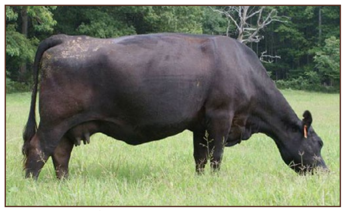
WRA Sarah 936Y - Dam of Lot 4