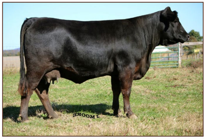
LARC Ms Mason 319Z - Dam of Lot 2