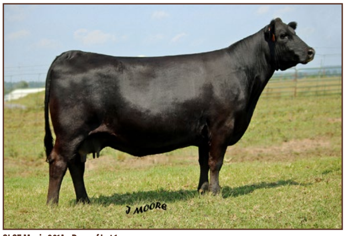
GLCF Mavis 301A - Dam of Lot 1