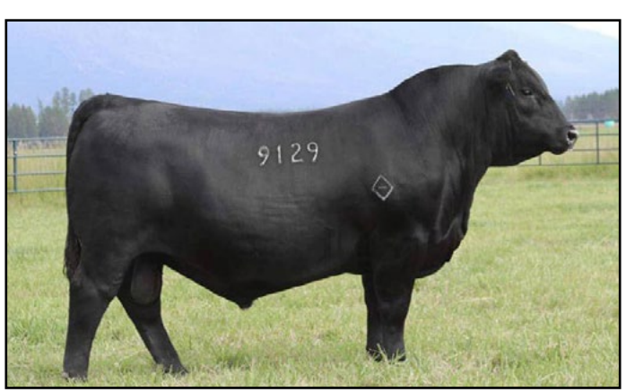
Montana Global 9129 - Al Sire for Pens 4, 5 and 6.

Thank You for choosing the Blue Ridge Brutes!